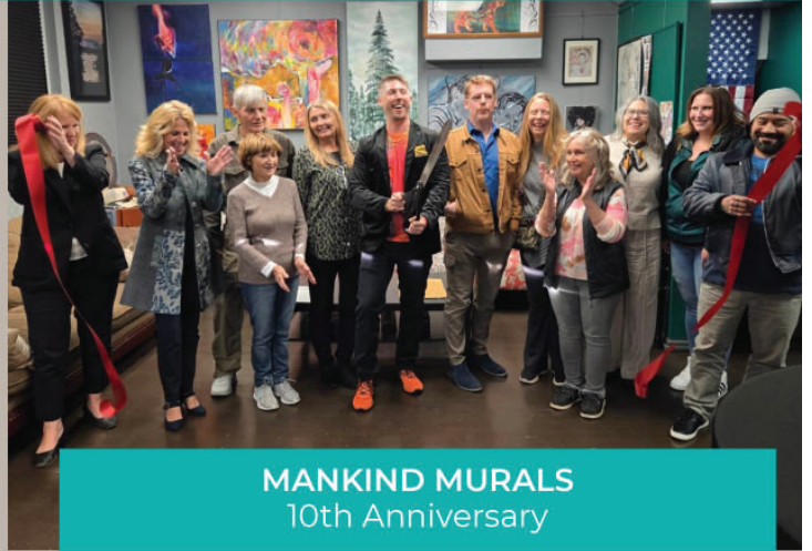
MANKIND MURALS 10th Anniversary