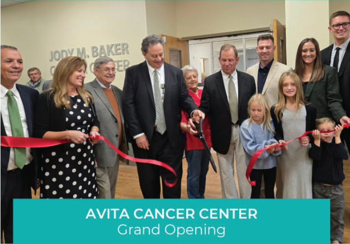
AVITA CANCER CENTER Grand Opening