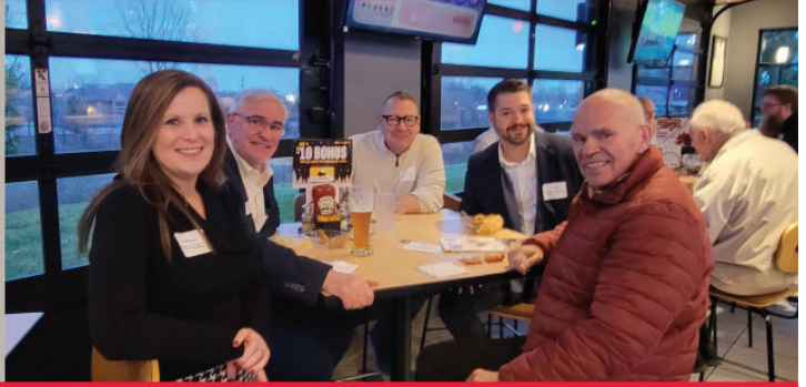
BUSINESS AFTER HOURS - BUFFALO WILD WINGS