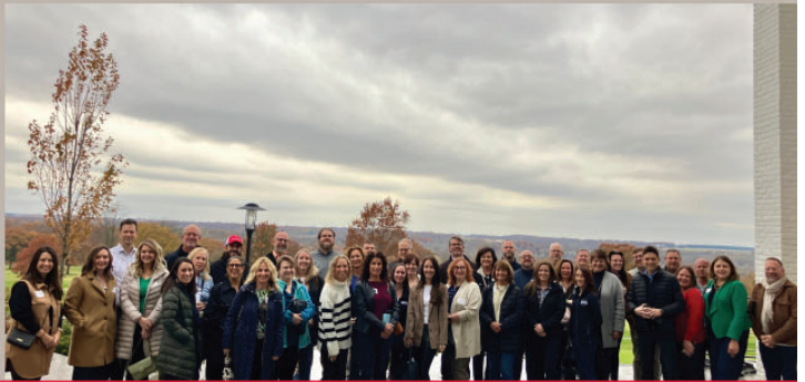
DISCOVER RICHLAND - ECONOMIC DEVELOPMENT TOUR