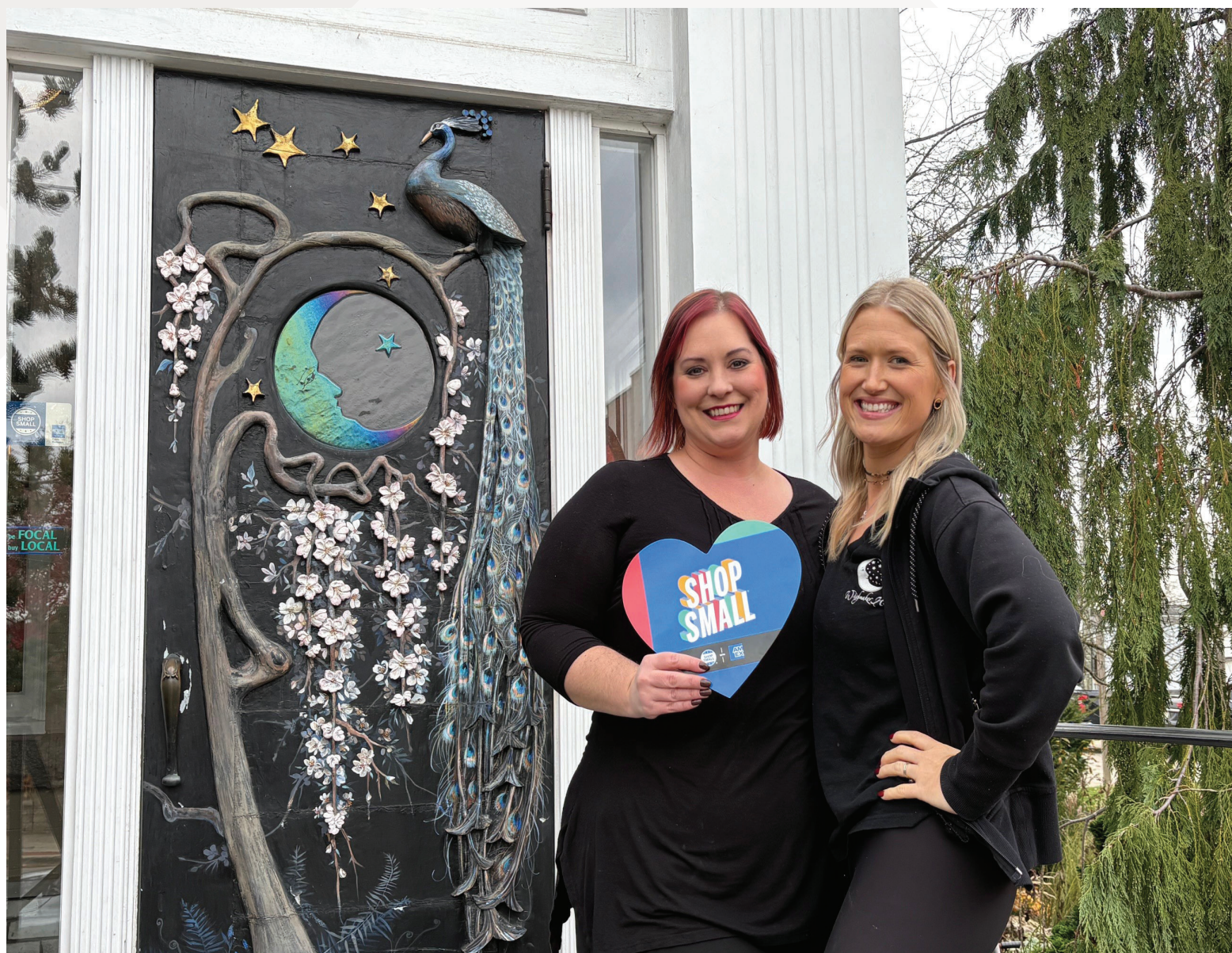
Shop Small - Richland County 2025