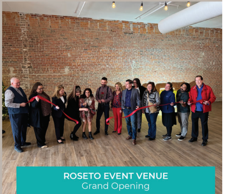
ROSETO EVENT VENUE Grand Opening