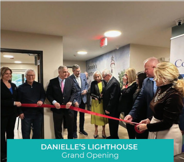
DANIELLE'S LIGHTHOUSE Grand Opening