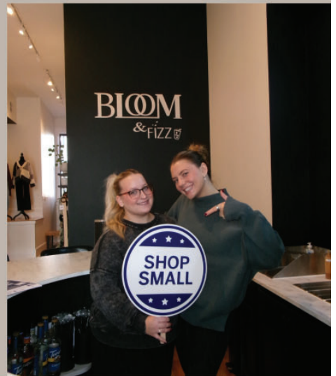
SHOP SMALL - RICHLAND COUNTY