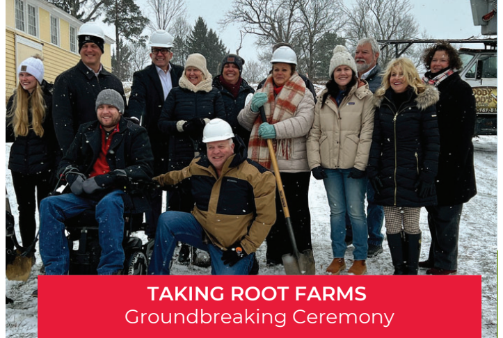
TAKING ROOT FARMS Groundbreaking Ceremony