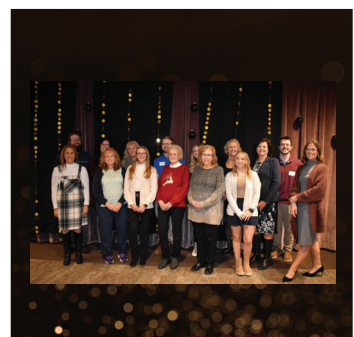
SOUTHERN TITLE OF OHIO, LTD.