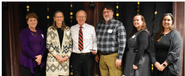
The Friendly House Large Non-Profit of the Year