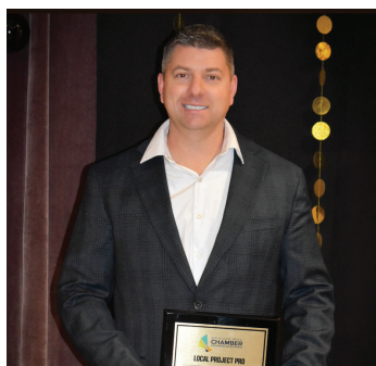
LOCAL PROJECT PRO