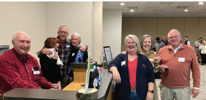
RICHLAND GIVES BAH