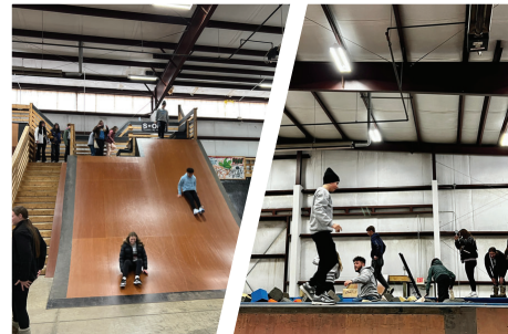
Students had a blast at Stoke Run Action Sports Park, jumping into foam pits and sliding down ramps.