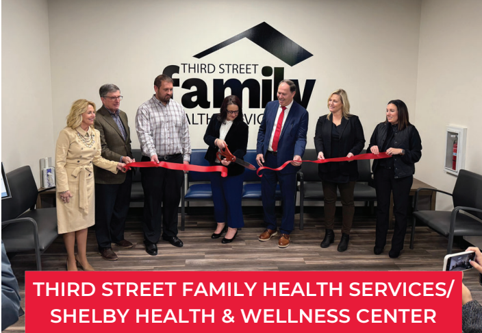
THIRD STREET FAMILY HEALTH SERVICES/ SHELBY HEALTH & WELLNESS CENTER