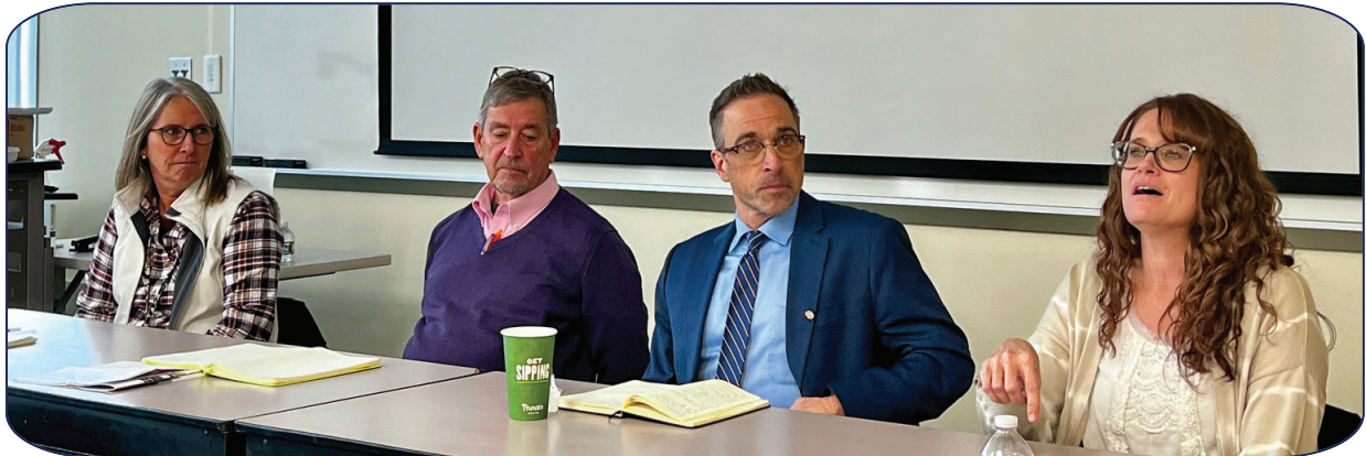
A panel of four business and education leaders talked about ways to empower employees and build a strong organizational culture.

Our December program day highlighted the collaboration and innovation in our workforce ecosystem. Participants were encouraged by the opportunities available for students to plan their careers and for employers to upskill their workforce.