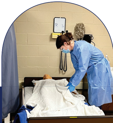
LU participants enjoyed a delicious lunch by Pioneer Career and Technology Center culinary students, while learning about student programs and the new YouScience assessments for high school freshman. The group had the opportunity to tour 12 different labs at the school.

Learn more about program days at facebook.com/LeadershipUnlimited .