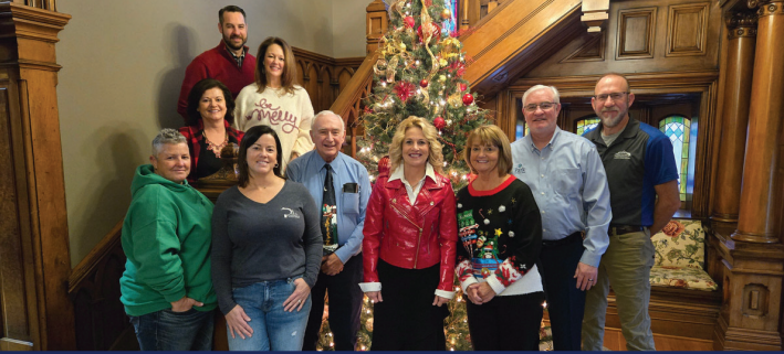
AMBASSADOR HOLIDAY PARTY