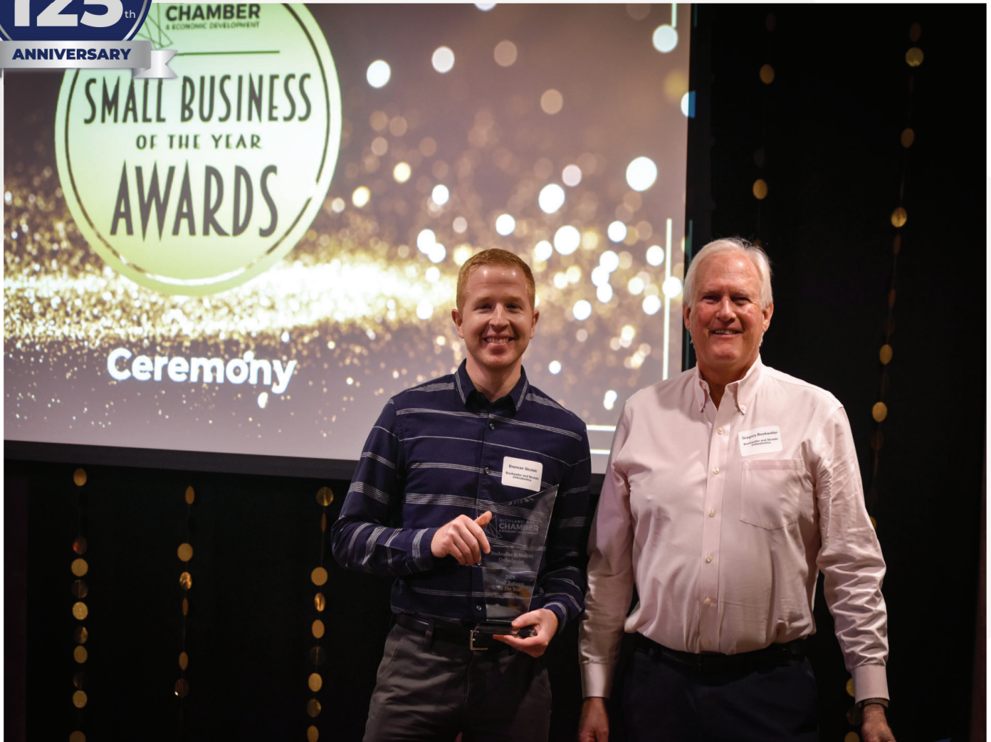
Bookwalter & Skulski Orthodontics, 2024 Small Business of the Year in the 14 Employees & Under category.