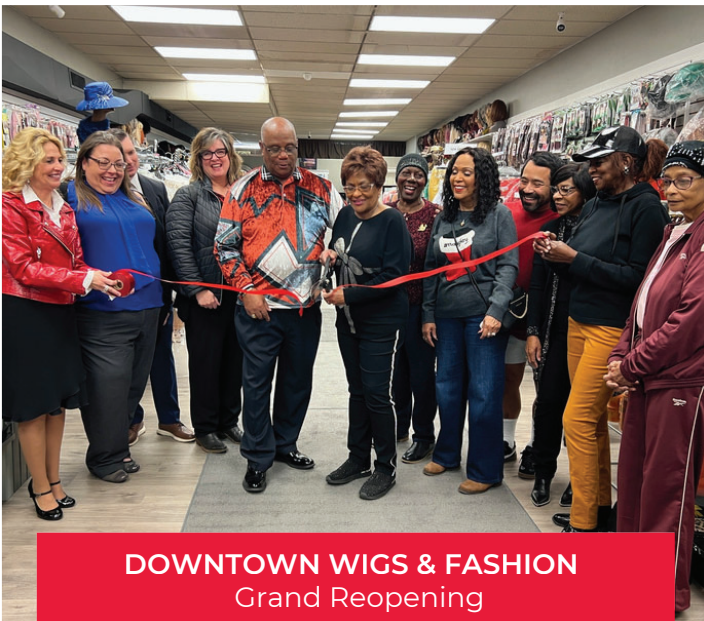
DOWNTOWN WIGS & FASHION Grand Reopening