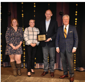
EICHINGER BRAFFORD MCCLEAN GROUP - MERRILL LYNCH WEALTH MANAGEMENT