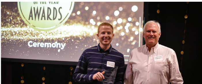
Bookwalter & Skulski Orthodontics 14 Employees & Under Category