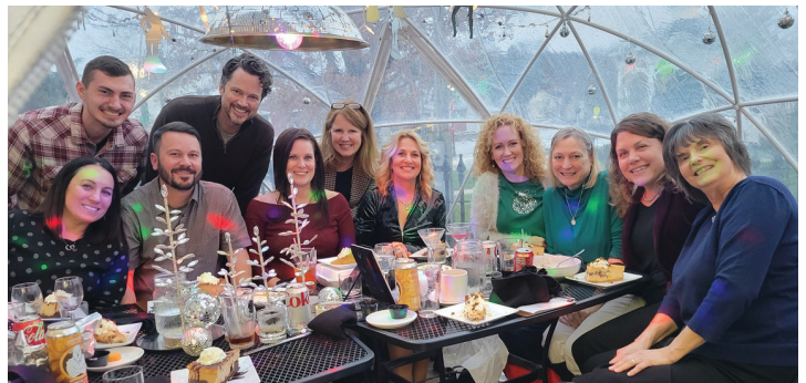
CHAMBER STAFF CHRISTMAS PARTY