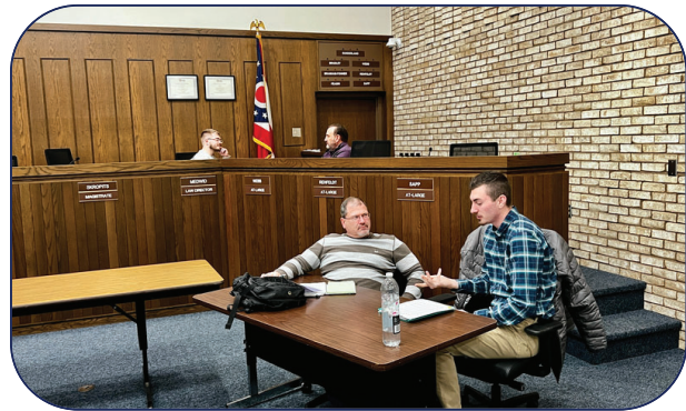
Mentors joined the participants to discuss goals and opportunities for 2025.