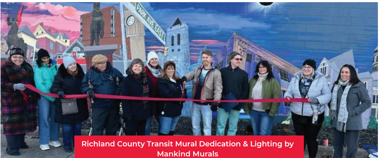
Richland County Transit Mural Dedication & Lighting by Mankind Murals