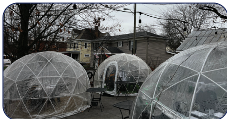
Lunch was hosted in igloos at Wishmaker House Bed & Breakfast, where community development initiatives were shared.