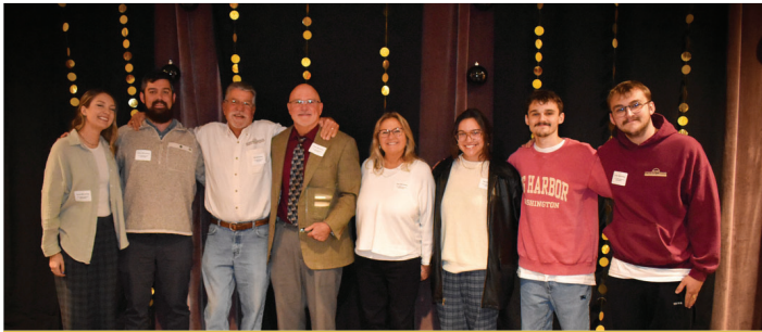
K.E. McCartney & Associates, Inc. 15+ Employees & Over Category