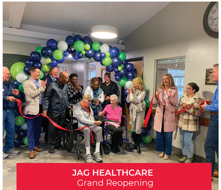
JAG HEALTHCARE Grand Reopening