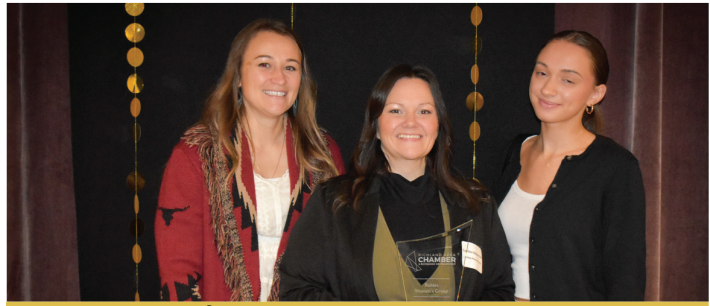
Rubies Women's Group Small Non-Profit of the Year