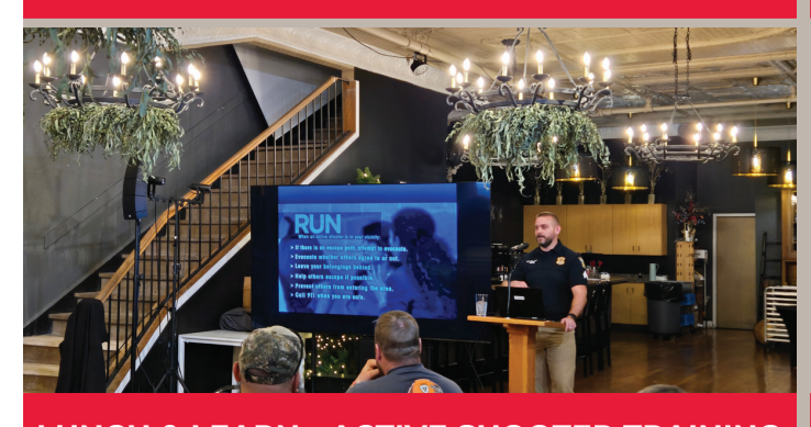
LUNCH & LEARN - ACTIVE SHOOTER TRAINING