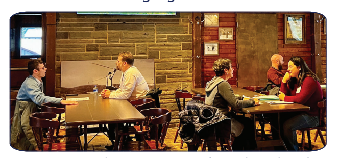
Mentors and mentees were introduced and had their first conversations.