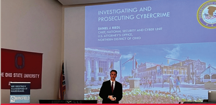
THE GROWING WORLD OF CYBERCRIME