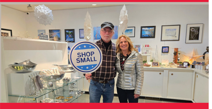
SMALL BUSINESS SATURDAY