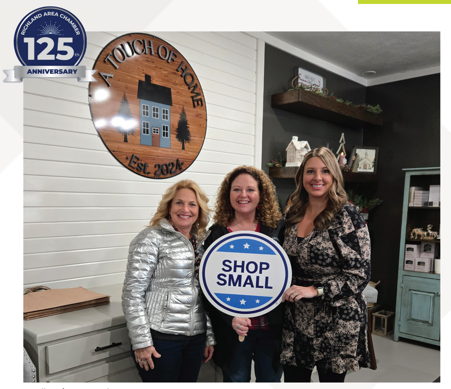
Small Business Saturday 2024 was a success!