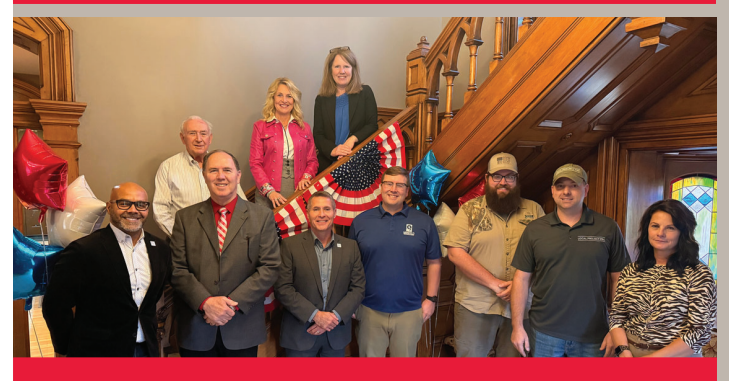
SBA VISIT WITH VETERAN OWNED BUSINESES