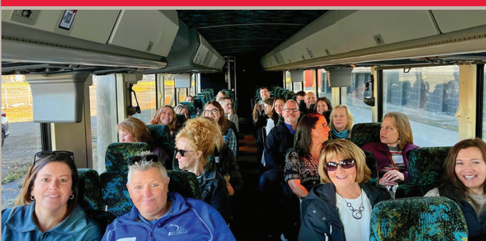
DISCOVER RICHLAND TOUR