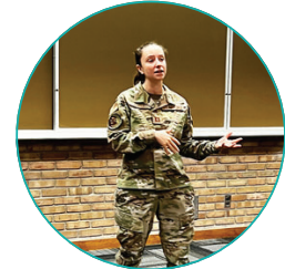
The 179th Cyberspace Wing representatives shared about their mission and career opportunities.