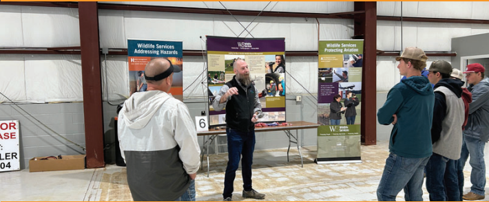
AVIATION CAREER DAY