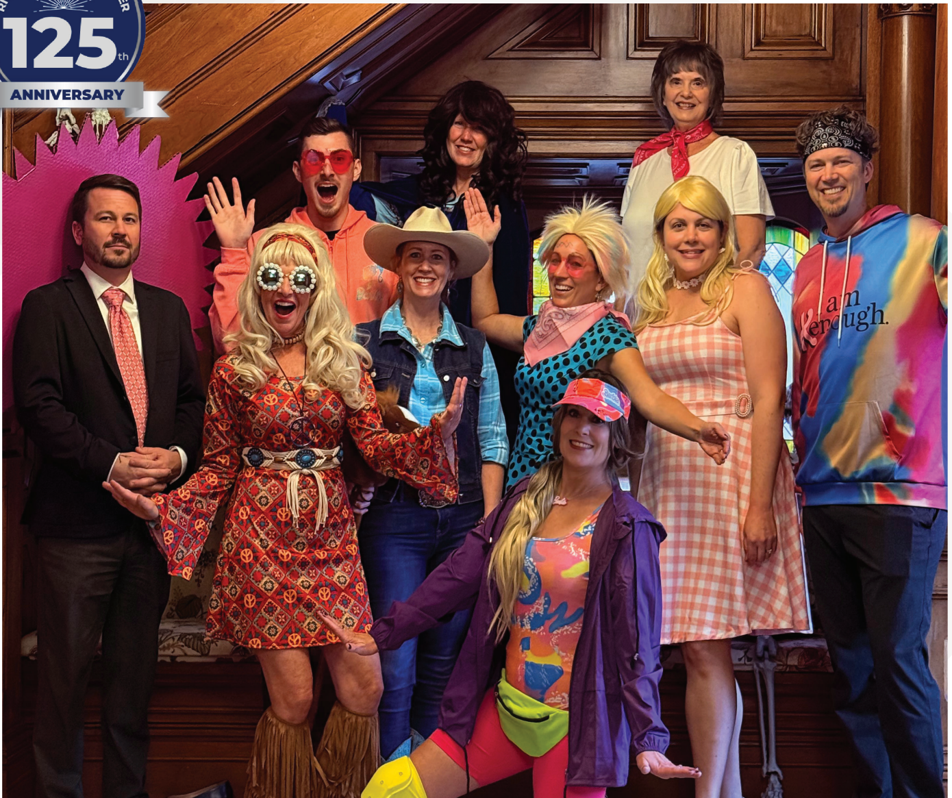
The Chamber staff took a break from Barbies Dream House to explore downtown Mansfield for Halloween!