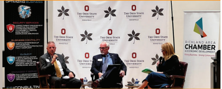
OCTOBER CYBERSECURITY EVENT