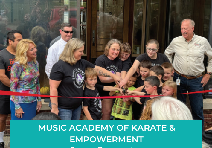
MUSIC ACADEMY OF KARATE & EMPOWERMENT Grand Reopening