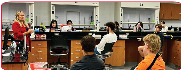
The Ohio State University at Mansfield faculty and staff gave STEM lab tours while discussing majors and pathways with students.