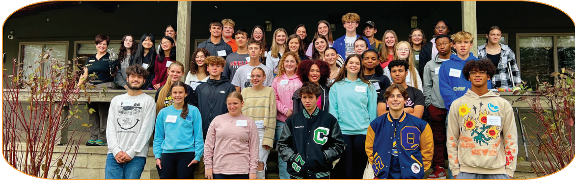
Students visited the Ohio Bird Sanctuary for an owl educational program and toured the grounds.

This year's class of 41 high school sophomores learned how different industries collectively contribute to a vibrant Richland County during the November program day.