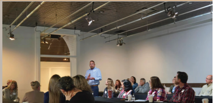
CHAMBER COFFEE AT THE ONTARIO CENTER