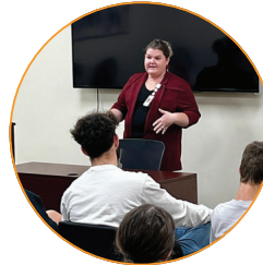
Students learned about Avita Health System's pharmacy, supply chain, nursing, and radiology departments.