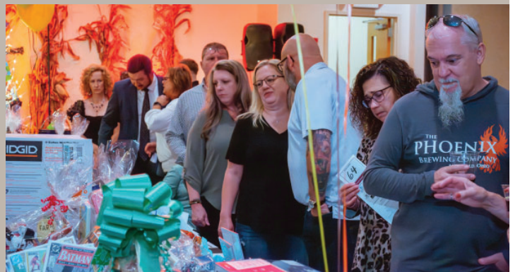
8TH ANNUAL SAVOR & SIP AUCTION AND FOOD TASTING