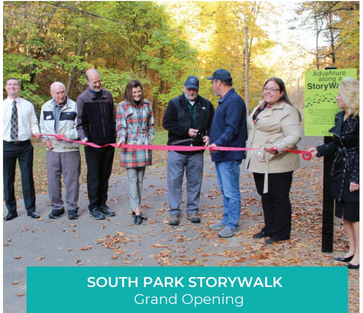
SOUTH PARK STORYWALK Grand Opening