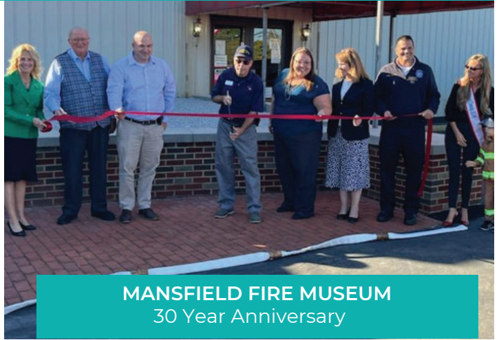
MANSFIELD FIRE MUSEUM 30 Year Anniversary