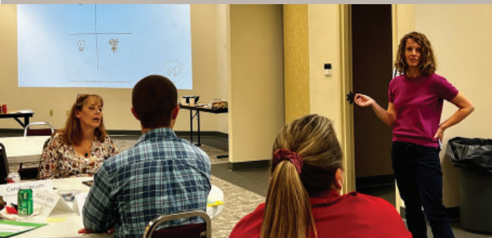
PROJECT MANAGEMENT WITH AGILE AND SCRUM