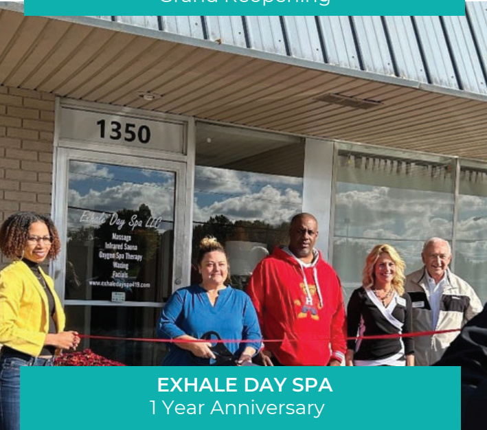
EXHALE DAY SPA 1 Year Anniversary