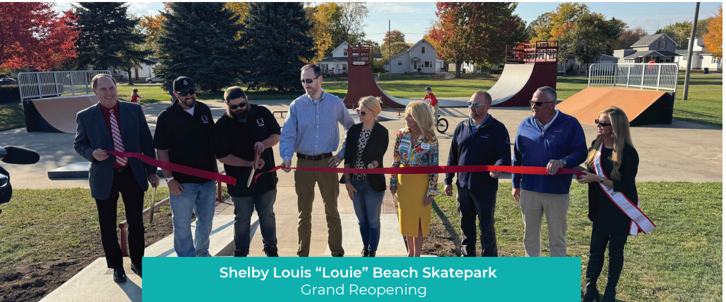
Shelby Louis "Louie" Beach Skatepark Grand Reopening