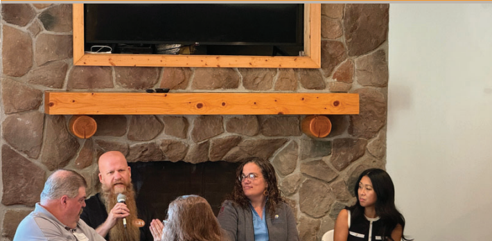
SMALL BUSINESS OF THE YEAR NOMINATION BREAKFAST