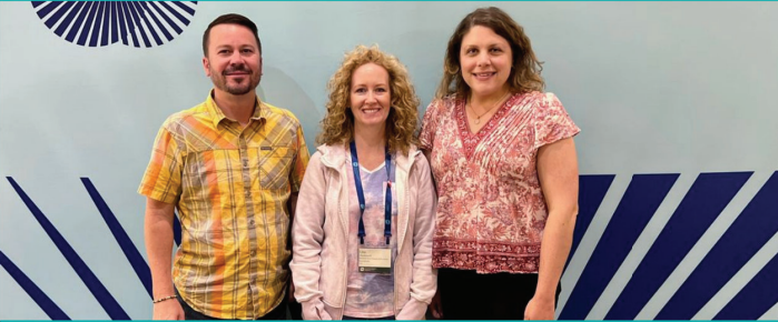
INSTITUTE FOR ORGANIZATION MANAGEMENT