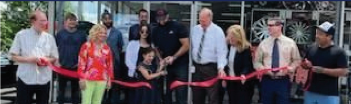
MANSFIELD TIRE BROS Grand Opening