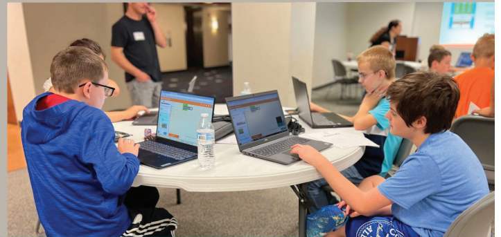
CODE A CARNIVAL