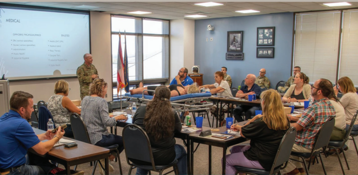
TEACHER TECH BOOTCAMP