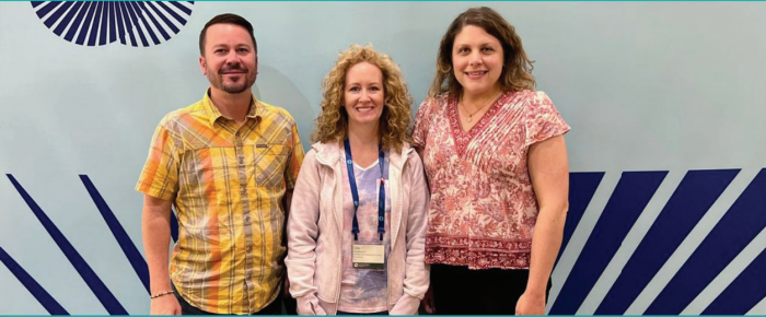
INSTITUTE FOR ORGANIZATION MANAGEMENT