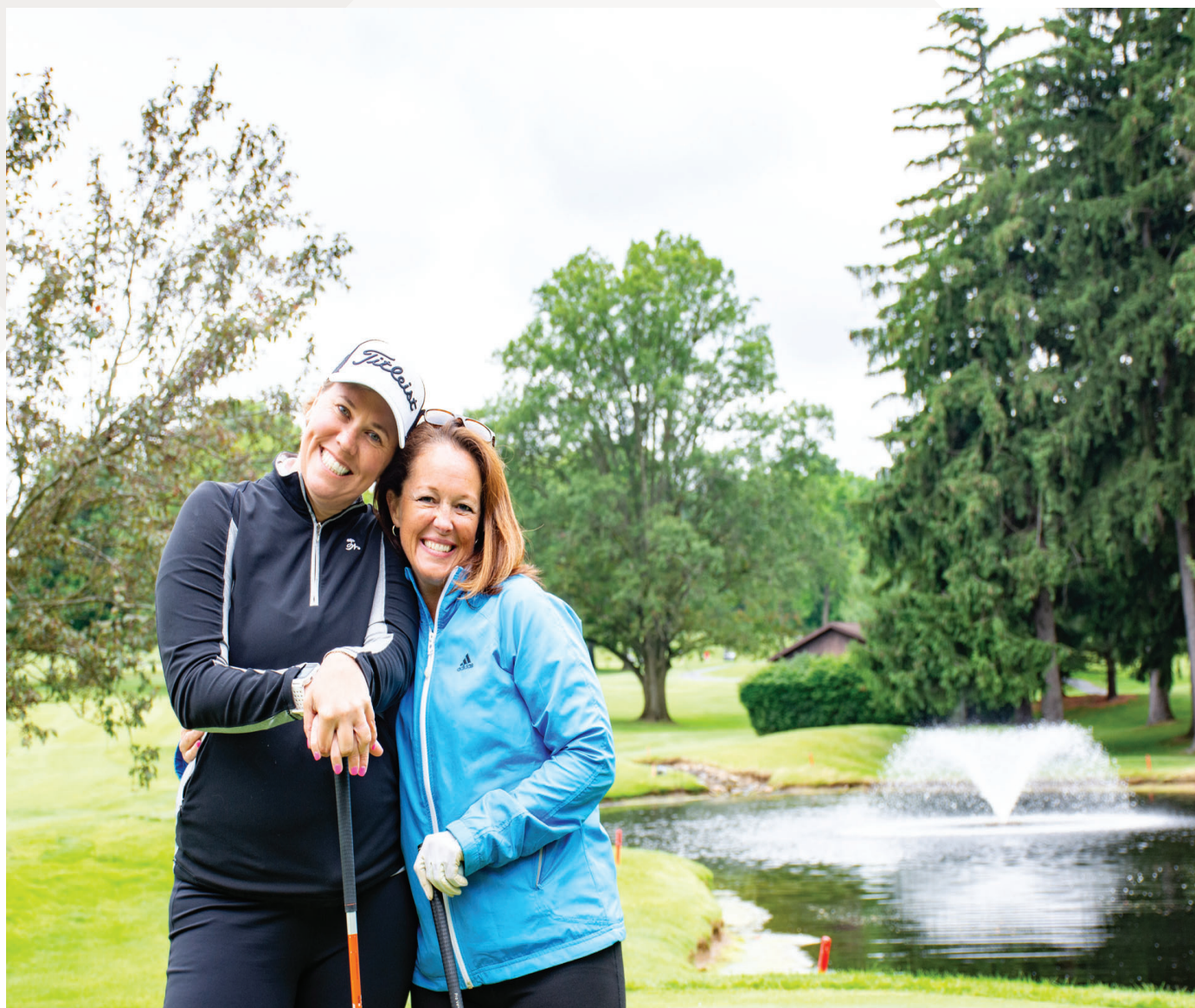
Chamber Golf Classic