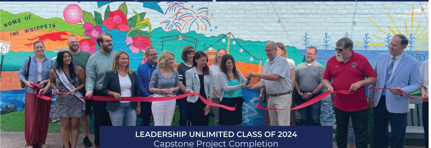
LEADERSHIP UNLIMITED CLASS OF 2024 Capstone Project Completion