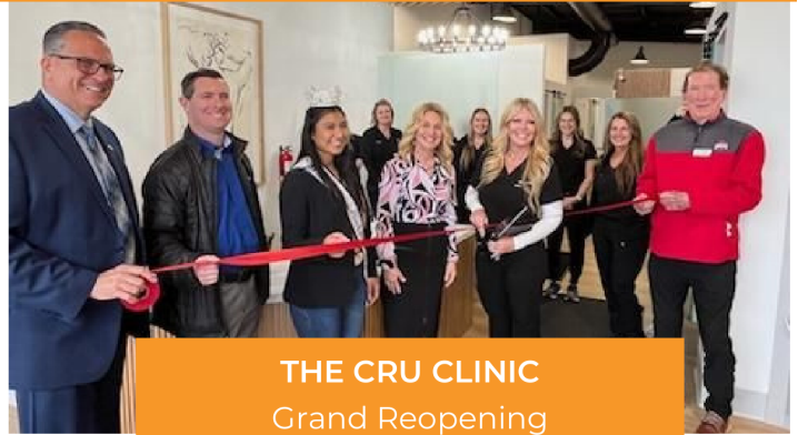
THE CRU CLINIC Grand Reopening