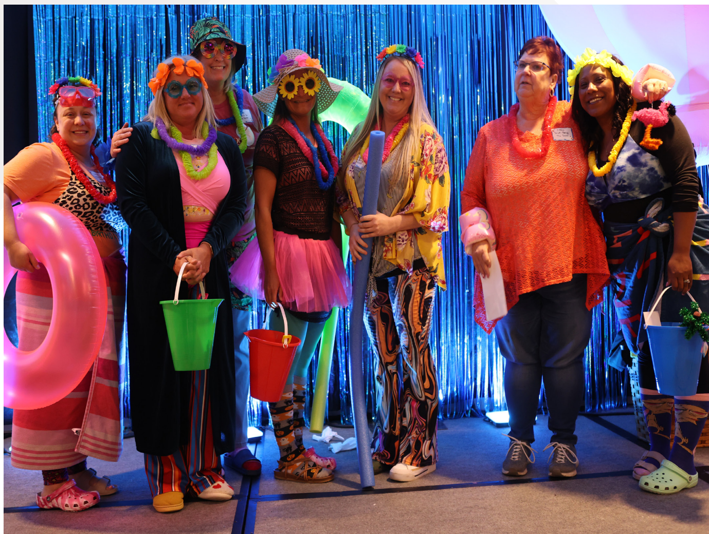
Business Professionals Day