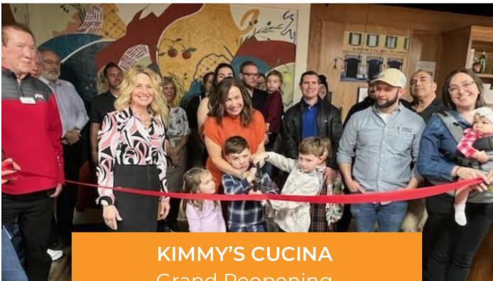
KIMMY'S CUCINA Grand Reopening