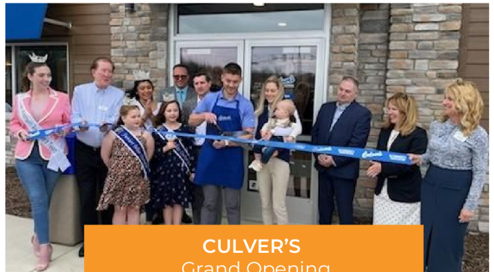
CULVER'S Grand Opening