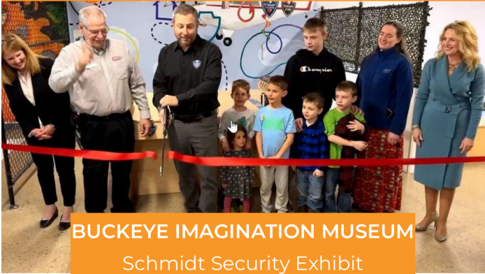
BUCKEYE IMAGINATION MUSEUM Schmidt Security Exhibit