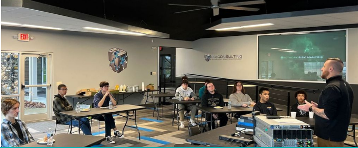
EXPLORING CAREER PATHWAYS IN TECHNOLOGY