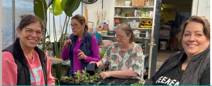
LU MANSFIELD BEAUTIFICATION TEAM