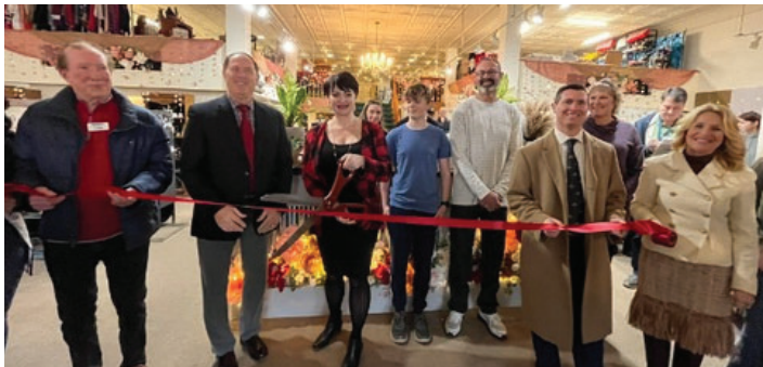
THE LITTLE SHOPS OF SHELBY