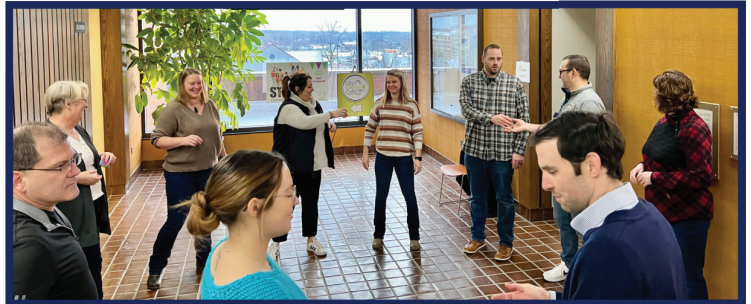
Participants learned to create and improve upon a process by tossing string balls. The groups improved the process so well that their completed time was less than 1 second!