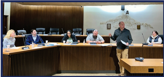
Class members analyzed and responded to a leadership case study on Challenge the Process.

Members of the class of 2024 analyzed ways to challenge the process during their January program day sponsored by Schmidt Security Pro. The group heard from many speakers about the impact of violent crime on our community, law enforcement responses, court systems, and re-entry services.