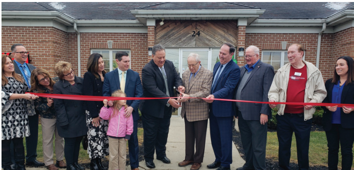
Avita Health System Shelby Walk-In Clinic & Medical Offices