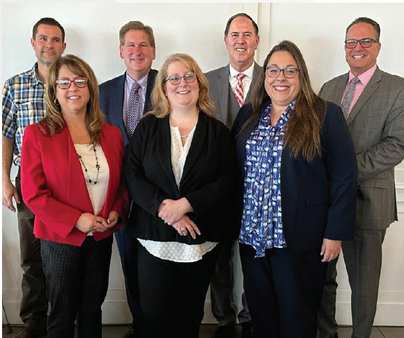
Mayoral Vision held on January 24, 2024.