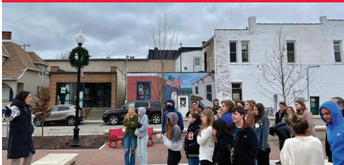
YOUNG LEADERS INSTITUTE