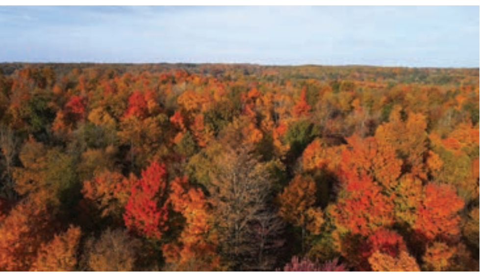
Gorman Nature Center

In Richland County, Ohio, our forests are always some of my favorite places, but autumn is an especially beautiful time! When fall trees burst into brilliant colors of crimson, gold, and amber hues, it signals not just the change of seasons but inflection points in our lives. In economic development we seek to find these same transition moments in our companies to support them with resources so their upcoming seasons are growing and our ecosystem is stronger.