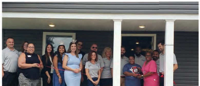
Habitat for Humanity New Build House