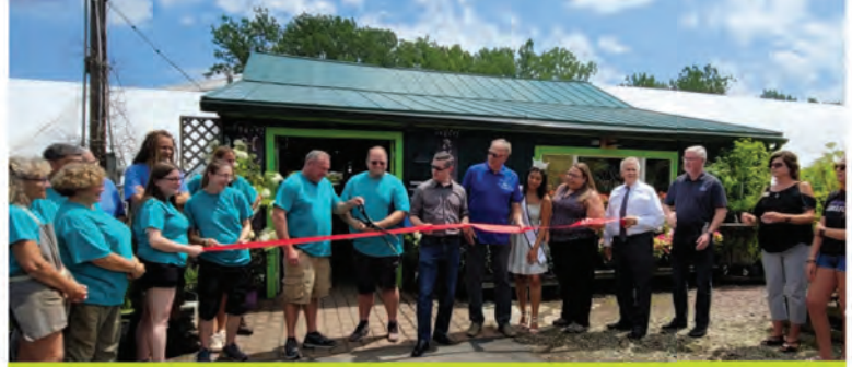
Alta Florist & Greenhouse