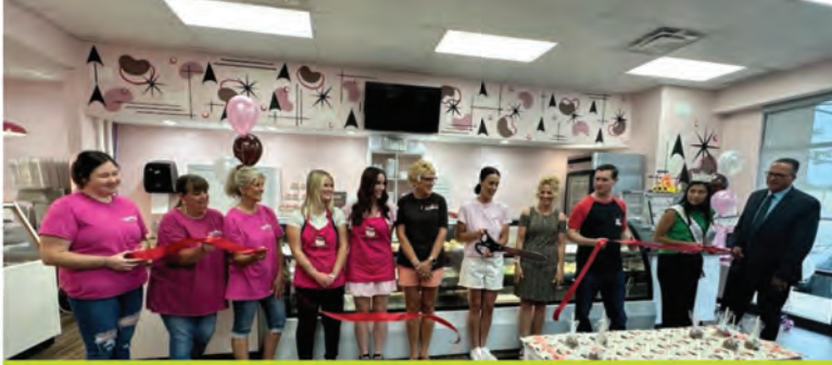
Bake My Day