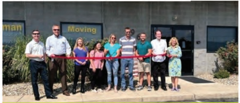
Dearman Moving & Storage