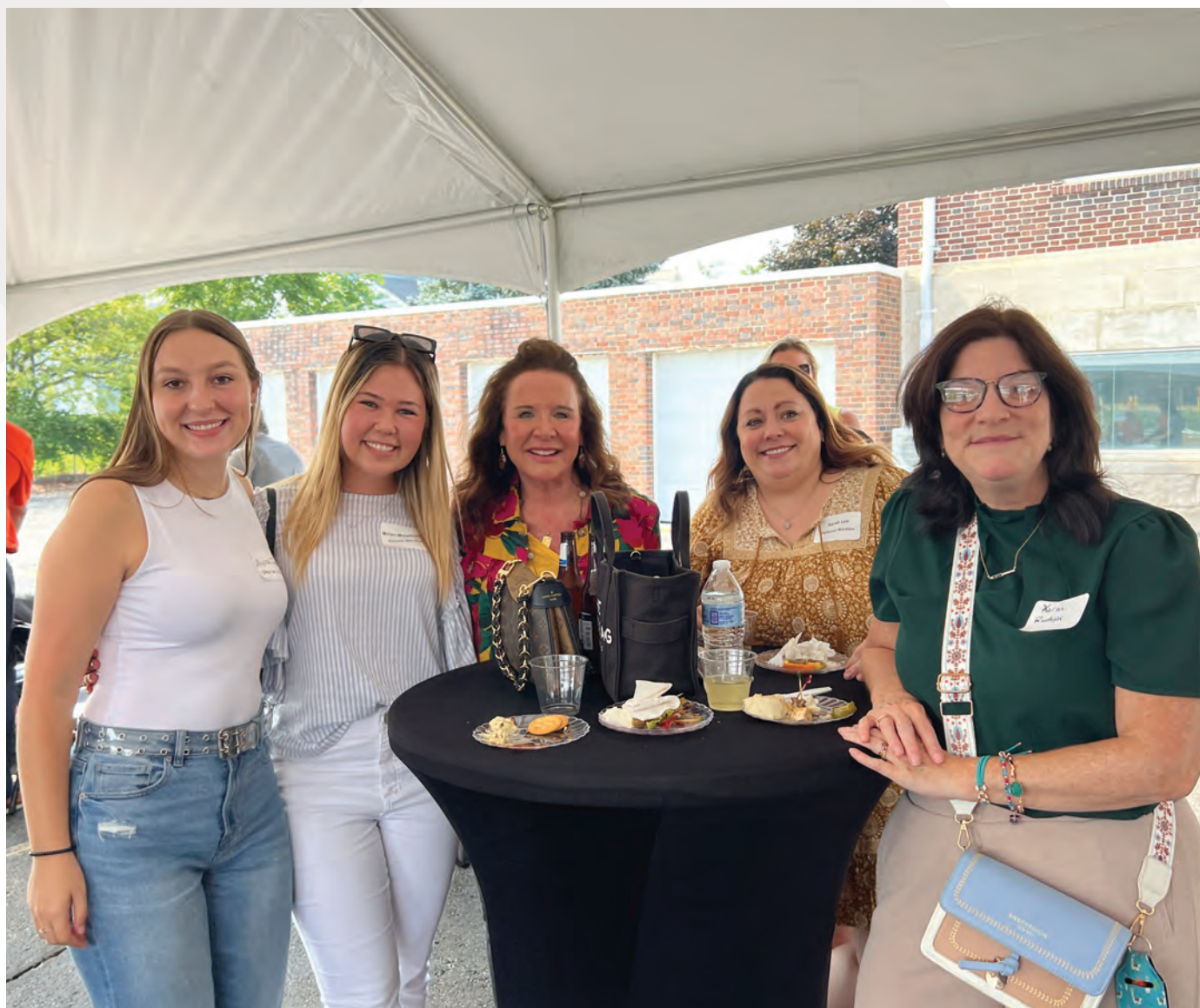
August Business After Hours at ArcelorMittal Tubular Products Shelby