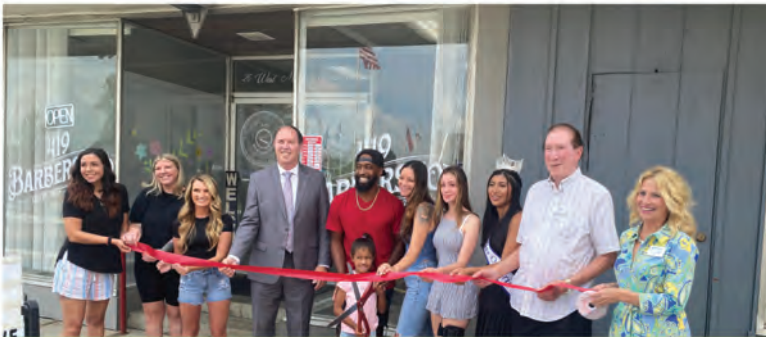
419 Barbershop (Shelby)