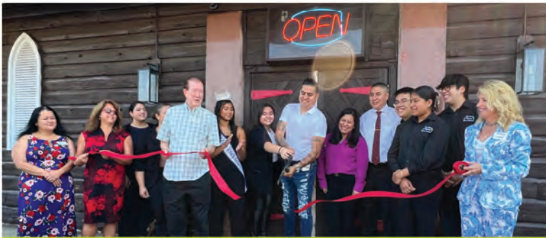
Panchos Tacos (Bellville)