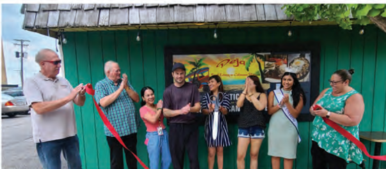
Deja Food Eatery & Cubano Bar