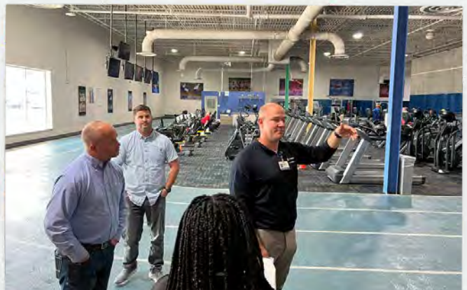
The class toured the OhioHealth fitness and rehab facility and learned about the health system's investments in North Central Ohio.

Learn more about program days at facebook.com/LeadershipUnlimited .