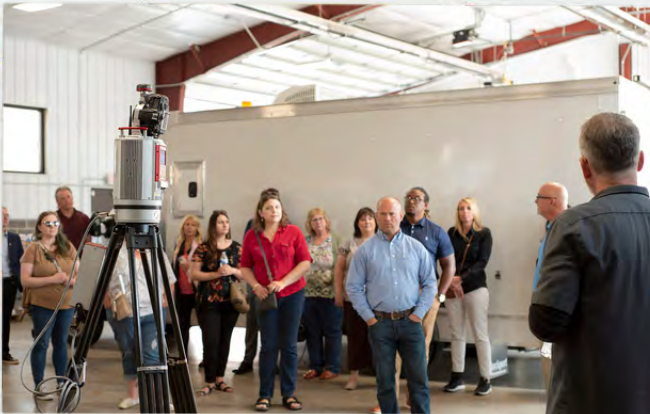
K.E. McCartney & Associates staff discussed their cutting-edge technology and key Richland County projects.