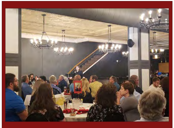
LU alumni from each decade were represented at the event.