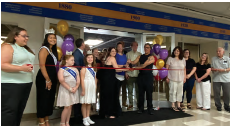
Richland Academy of the Arts - Mansfield

VISIT OUR FACEBOOK PAGE FOR MORE RIBBON CUTTING PICTURES AND VIDEOS!