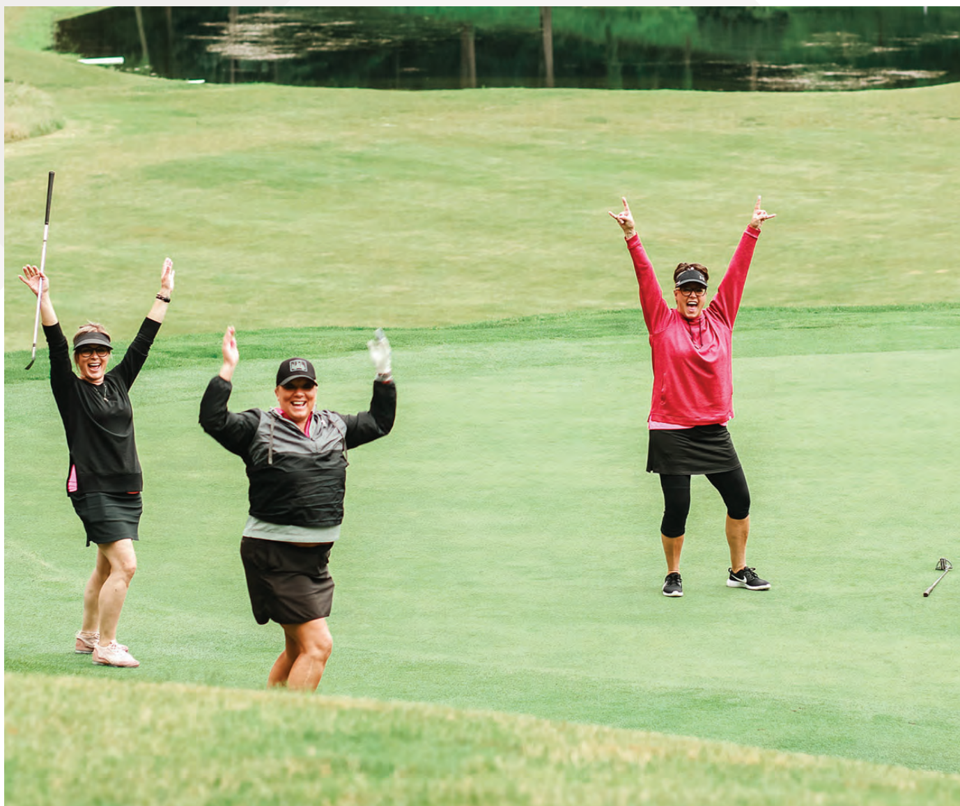
2023 CHAMBER GOLF CLASSIC