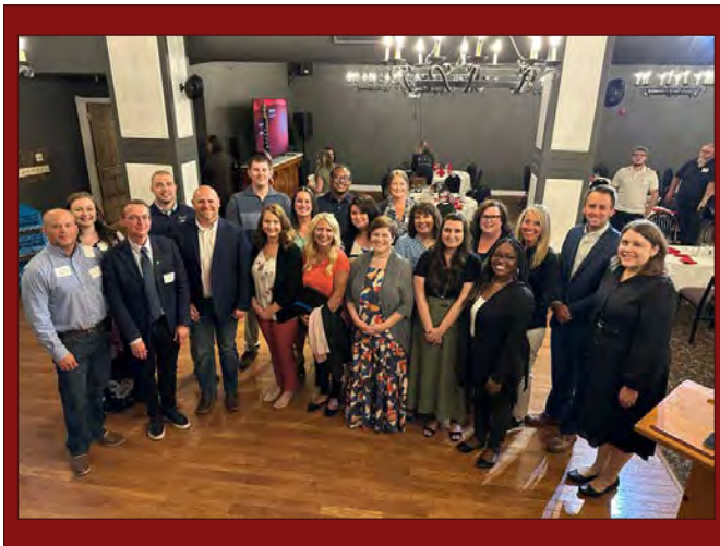
Leadership Unlimited class of 2023.