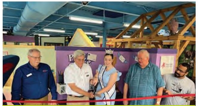
Buckeye Imagination Museum - Post Office Exhibit