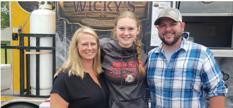
Wicky's Smokin' BBQ - 1 Year Anniversary Celebration