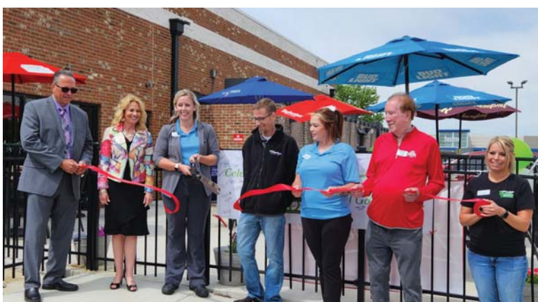
O'Charley's - Ontario

VISIT OUR FACEBOOK PAGE FOR MORE RIBBON CUTTING PICTURES AND VIDEOS!