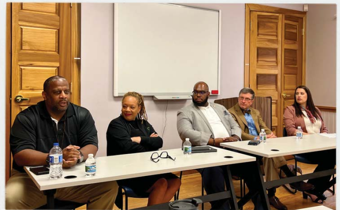
Leaders from throughout the county talked through DEI initiatives in terms of how we are doing and where we are going.