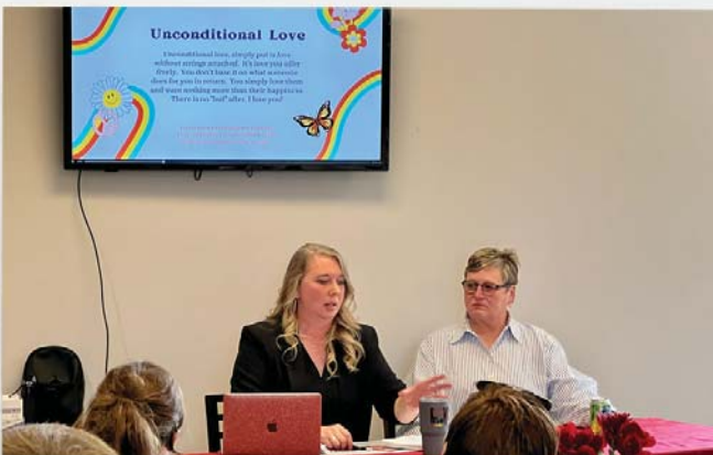
Love on a Mission members shared about their programming and outreach with LGBTQIA youth, families, and community members.