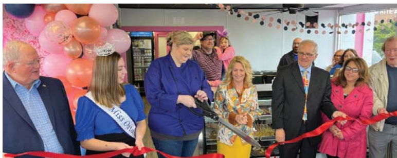
Jackie's Cheesecakes - Lexington