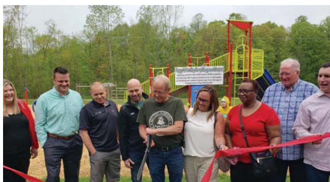
Friendly House/Happy Hollow Day Camp - Mansfield