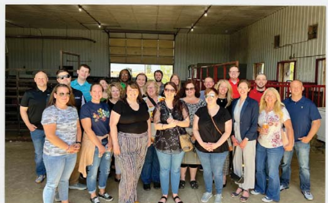
The class visited the Shelby High School FFA barn to learn about rural inclusion and career pathways for agriculture students.

Learn more about program days at facebook.com/LeadershipUnlimited .