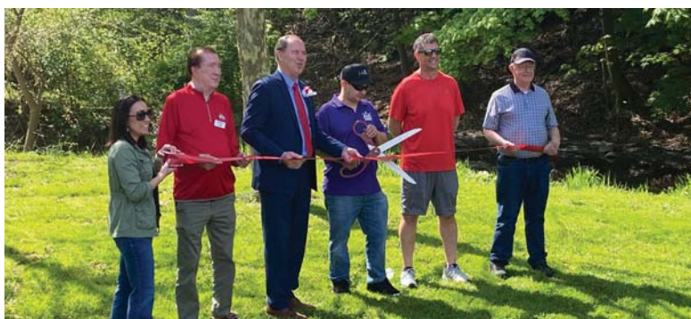
Shelby Putt & Approach Disc Golf Course at Seltzer Park