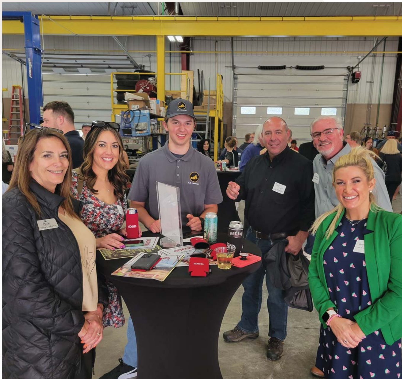
May Business After Hours at Adena