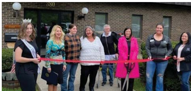
The Wellness Clinic - Mansfield