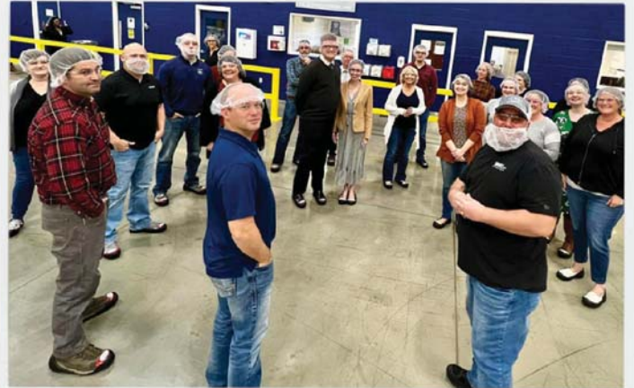
November - Workforce Development