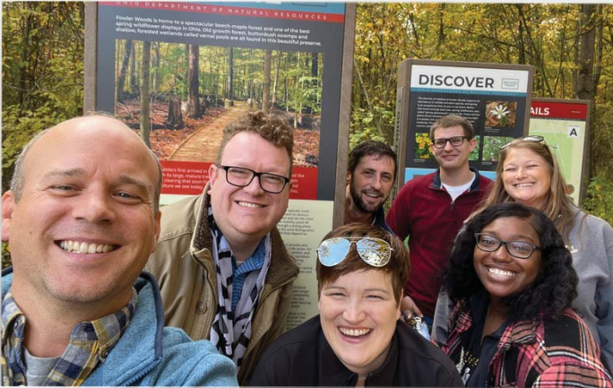
October - Road Rally