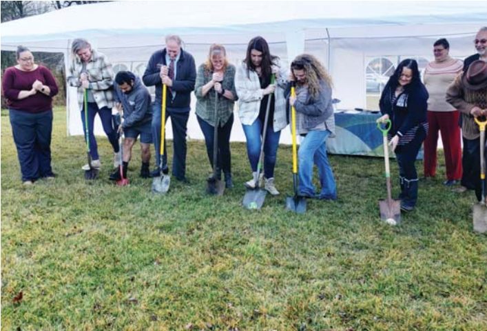
Richland Outreach Center Groundbreaking - Mansfield