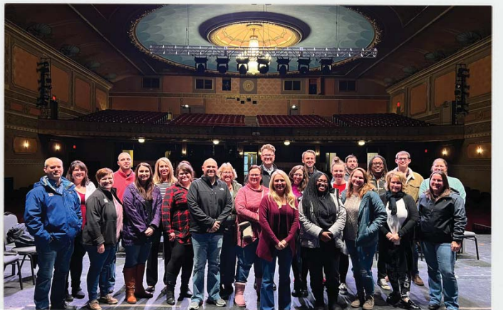
January - Tourism and Things to Do

The Leadership Unlimited Class of 2023 is exploring important issues facing our county. Speakers, panels, and tours stimulate conversation about potential solutions and action steps. Learn more about the program days at facebook.com/leadershipunlimited/ .