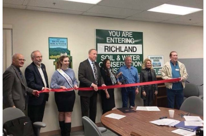
Richland Soil & Water Conservation District - Mansfield

VISIT OUR FACEBOOK PAGE FOR MORE RIBBON CUTTING PICTURES AND VIDEOS!