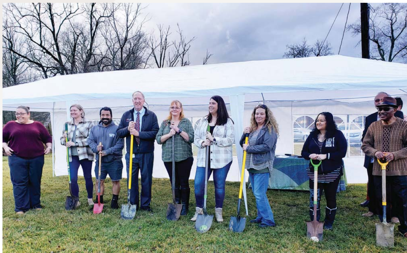
Richland Outreach Center Groundbreaking