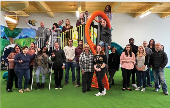
December - Youth Opportunities