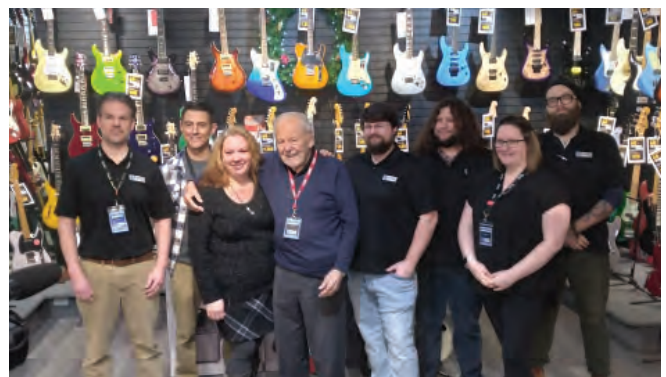
Metronome Music - Mansfield

VISIT OUR FACEBOOK PAGE FOR MORE RIBBON CUTTING PICTURES AND VIDEOS!