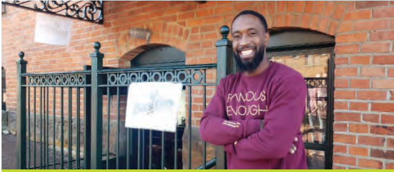
419 Barbershop - Mansfield