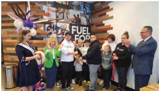
Everbowl - Ontario