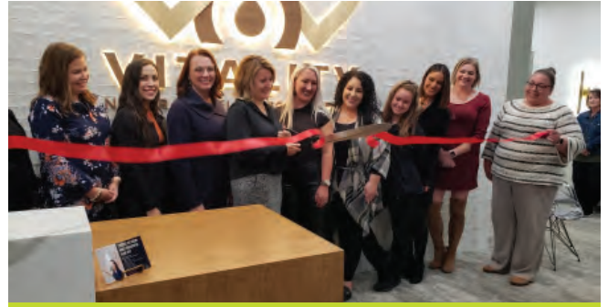
Vitality Natural Wellness - Mansfield