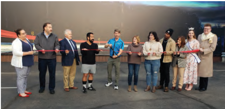
Mankind Murals Inc. - Mansfield