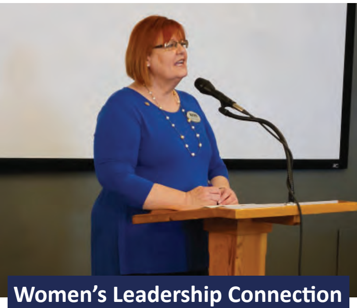
Women's Leadership Connection