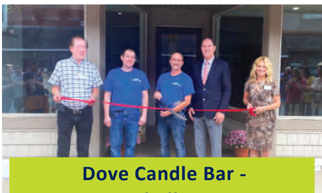
Dove Candle Bar - Shelby