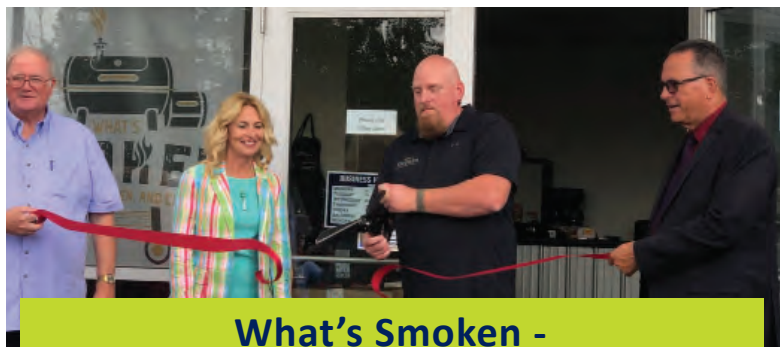
What's Smoked - Ontario