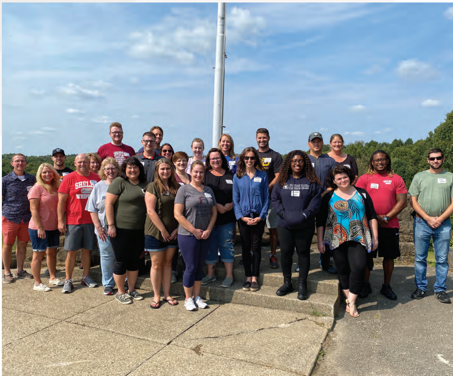
Leadership Unlimited Class of 2023 - will they be the best class ever?