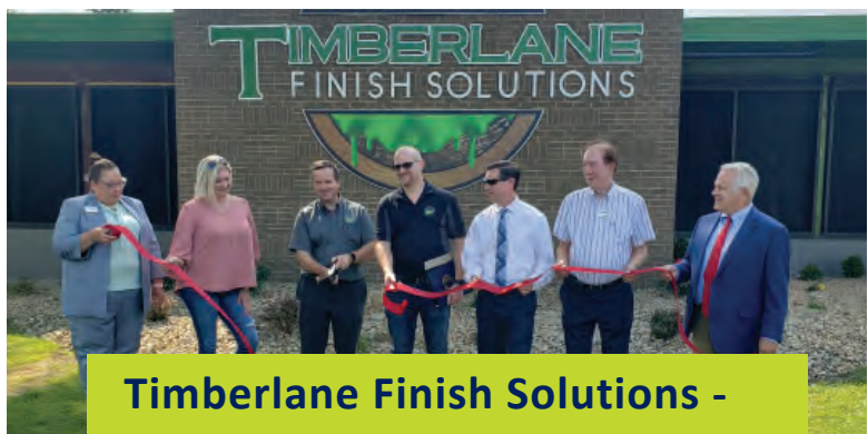
Timberlane Finish Solutions - Mansfield