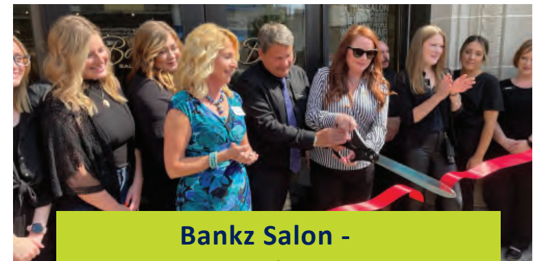
Bankz Salon - Mansfield