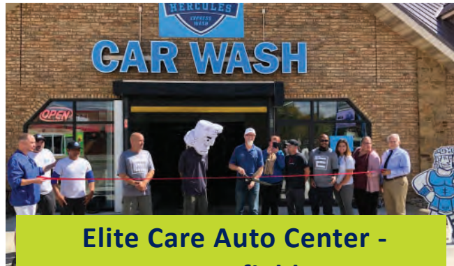
Elite Care Auto Center - Mansfield

VISIT OUR FACEBOOK PAGE FOR MORE RIBBON CUTTING PICTURES AND VIDEOS!