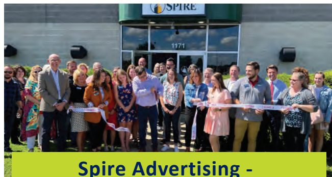
Spire Advertising - Ashland