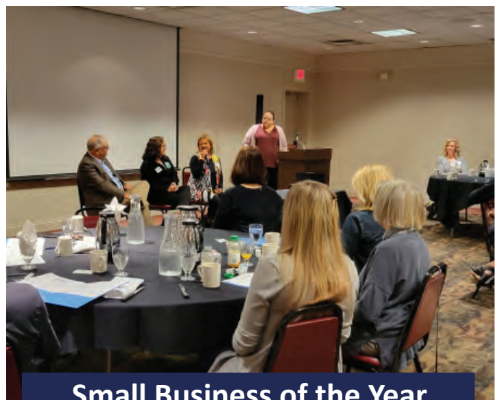
Small Business of the Year Nomination Breakfast