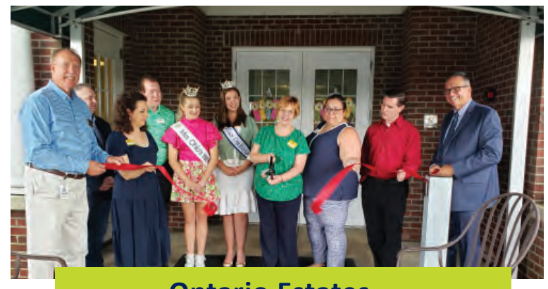
Ontario Estates - Ontario