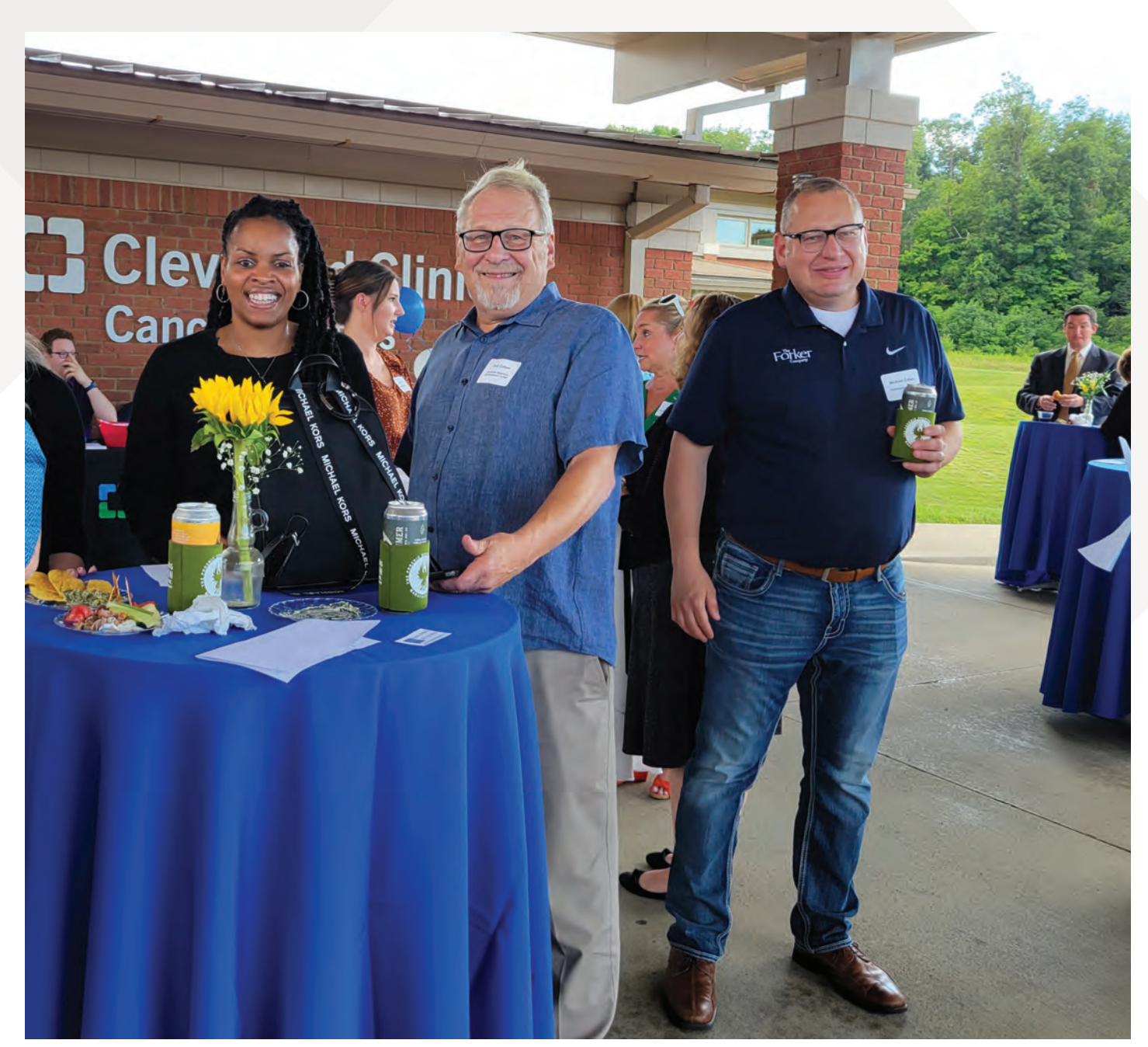
Business After Hours at Cleveland Clinic Cancer Center in Mansfield