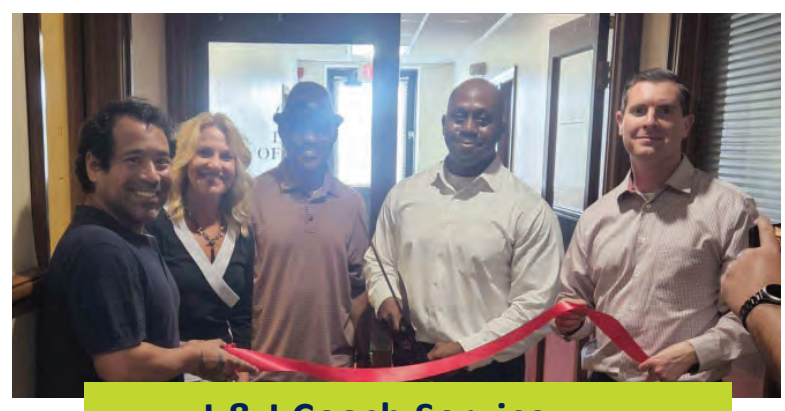
I & I Coach Service - Mansfield