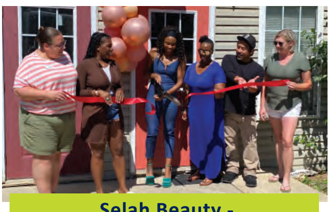
Selah Beauty - Mansfield