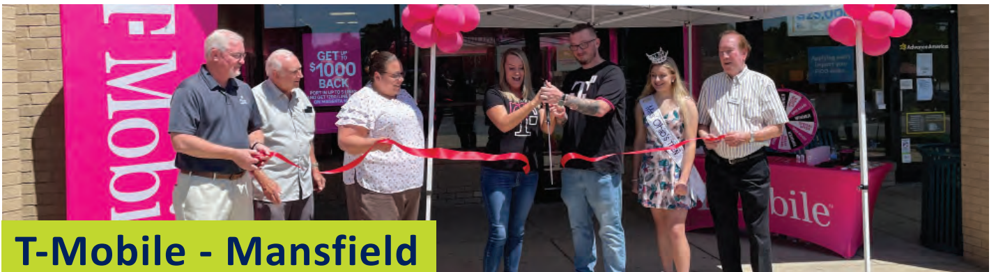
T-Mobile - Mansfield