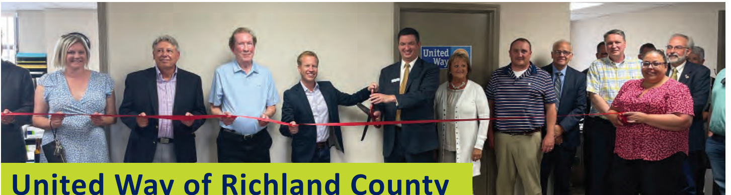
United Way of Richland County