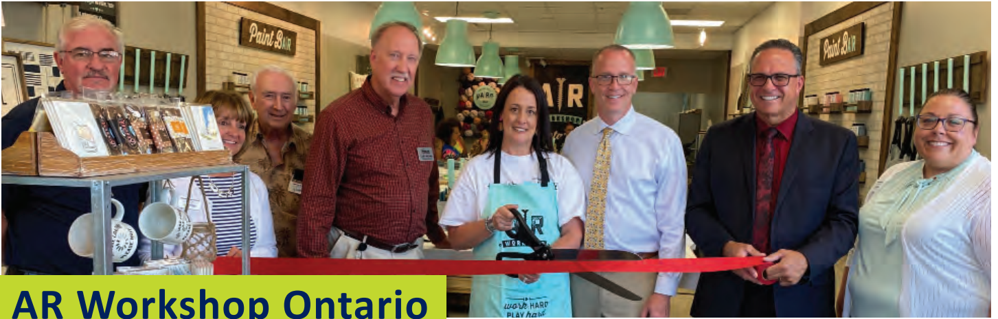
AR Workshop Ontario