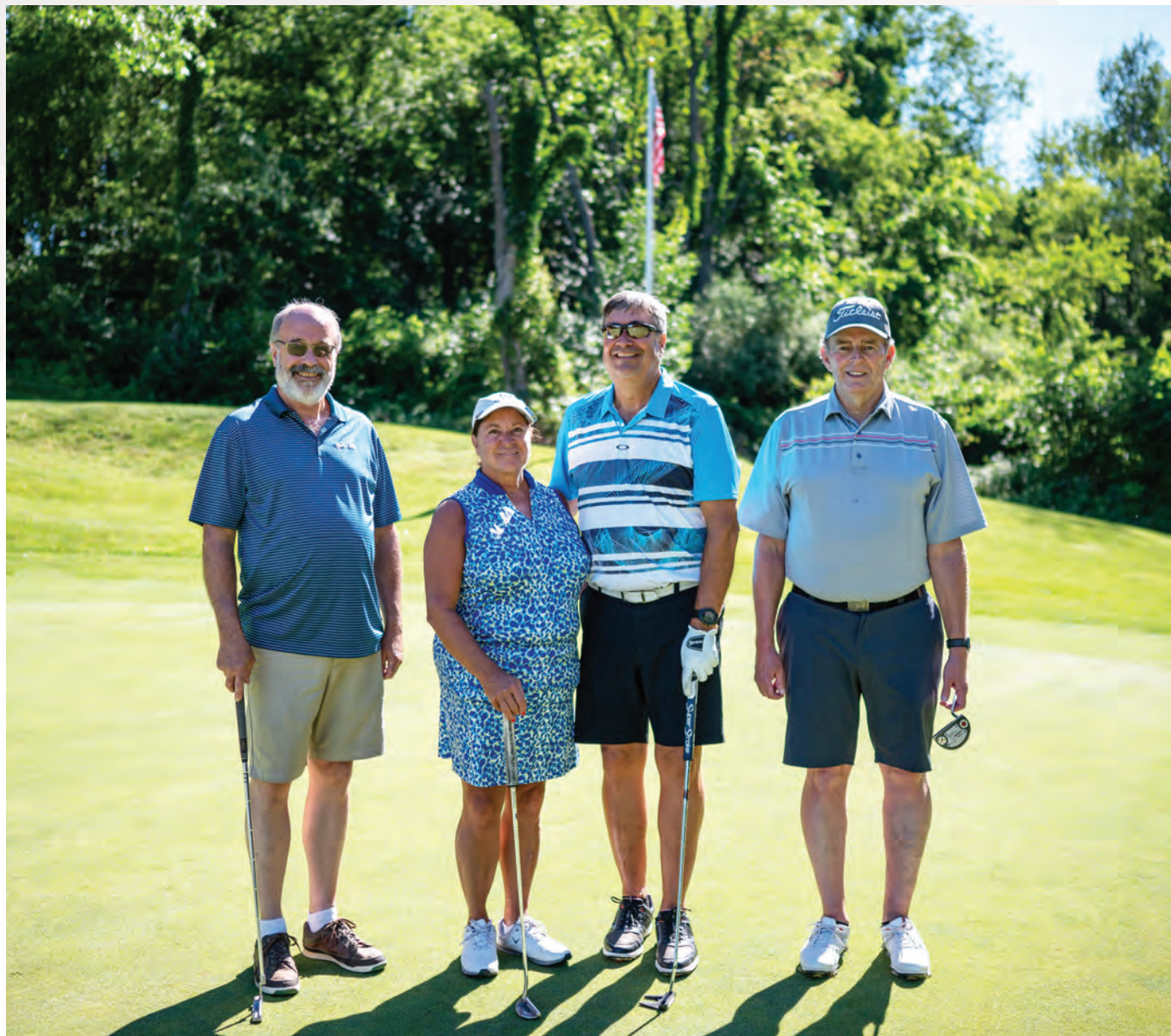
Chamber Golf Classic at Deer Ridge Golf Club, Eberts Heating & Cooling team