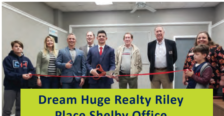
Dream Huge Realty Riley Place Shelby Office