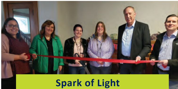
Spark of Light - Mansfield