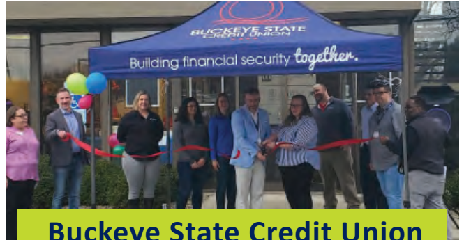
Buckeye State Credit Union - Mansfield