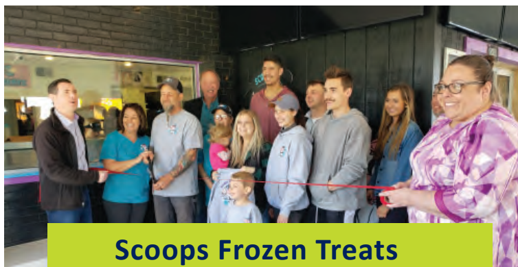
Scoops Frozen Treats - Mansfield