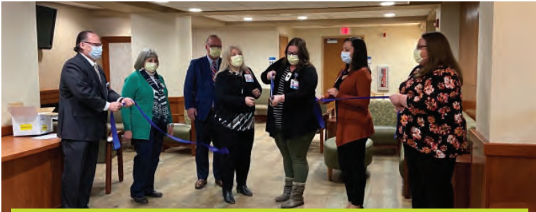
OhioHealth Mothers' Milk Bank Drop - Mansfield