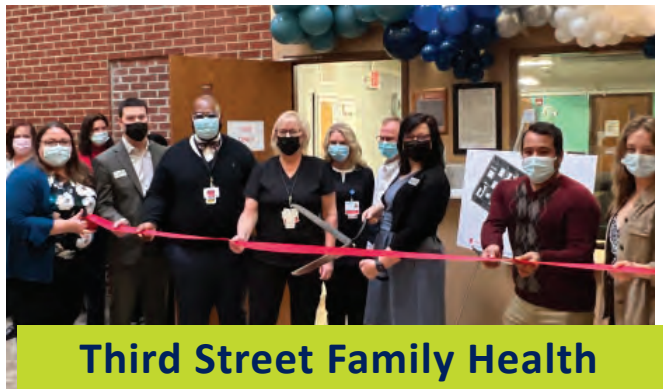
Third Street Family Health Services Dental Clinic- Mansfield