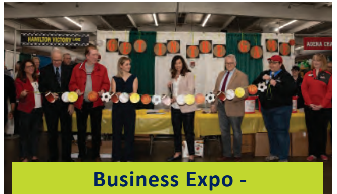
Business Expo - Mansfield