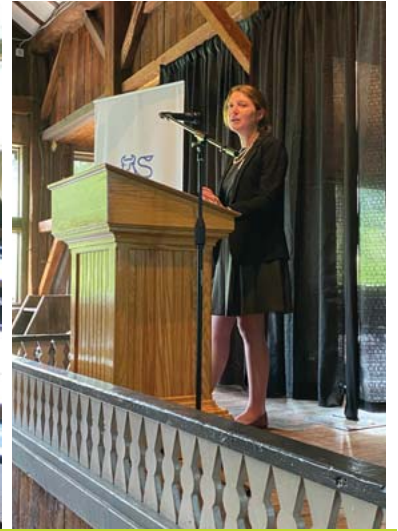
Regional Economic Forum