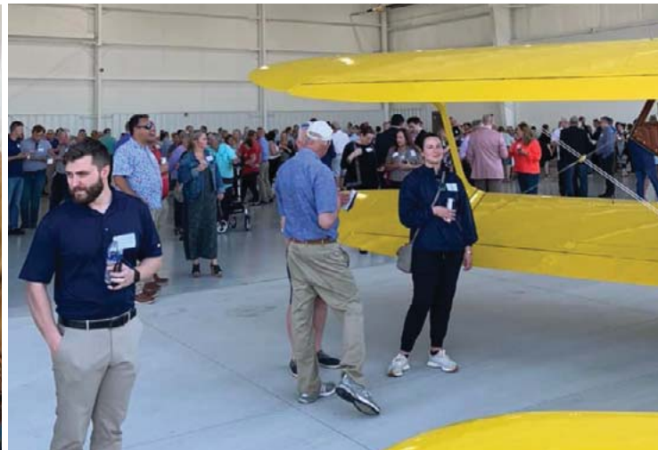
Business After Hours at Niss Aviation FBO