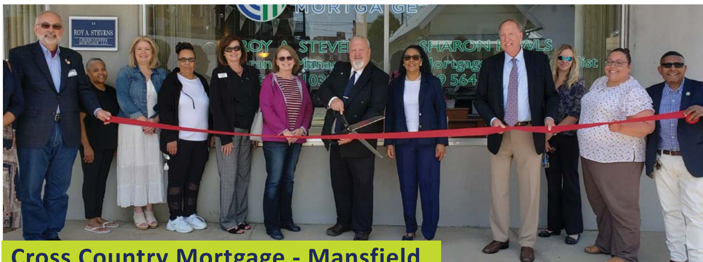
Cross Country Mortgage - Mansfield