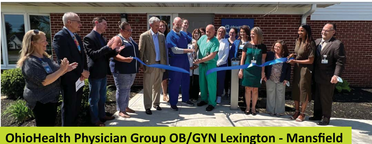
OhioHealth Physician Group OB/GYN Lexington - Mansfield