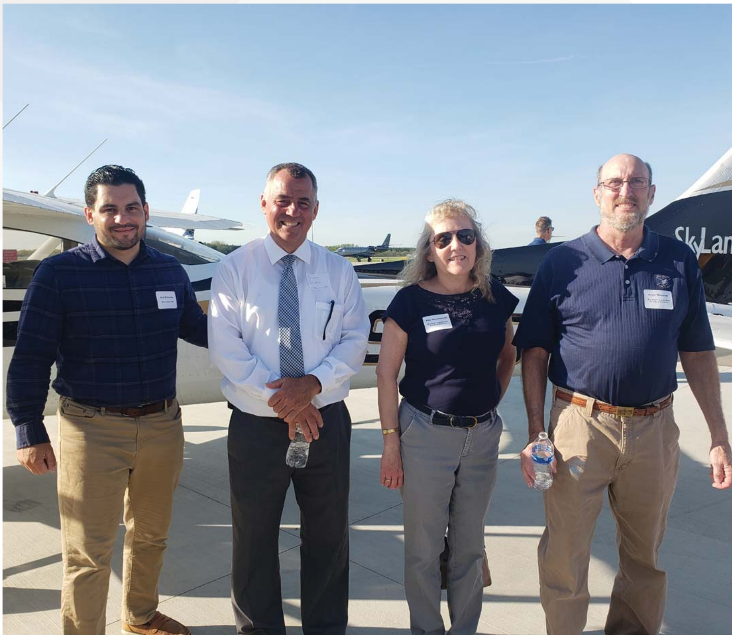
Business After Hours at Niss Aviation FBO