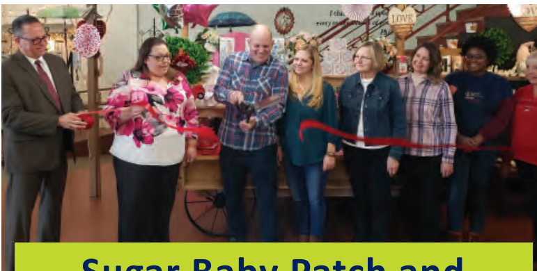
Sugar Baby Patch and Garden - Mansfield/Ontario