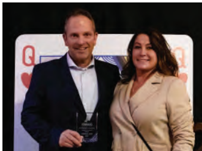
Niss Aviation FBO Economic Impact Award