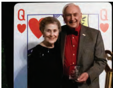
Merris Welge Economic Impact Award