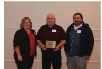
TERRA VALLEY EXCAVATING