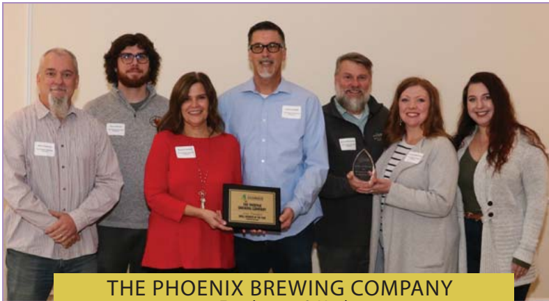
THE PHOENIX BREWING COMPANY 14 Employees & Under