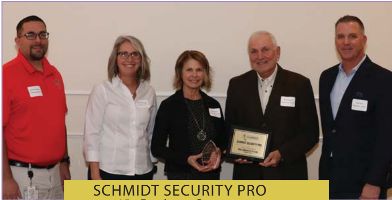
SCHMIDT SECURITY PRO 15+ Employee Category