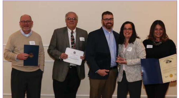
THE VISUAL BUCKET LIST FOUNDATION Small Nonprofit of the Year