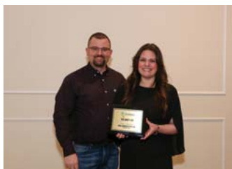
THE BOOT LIFE