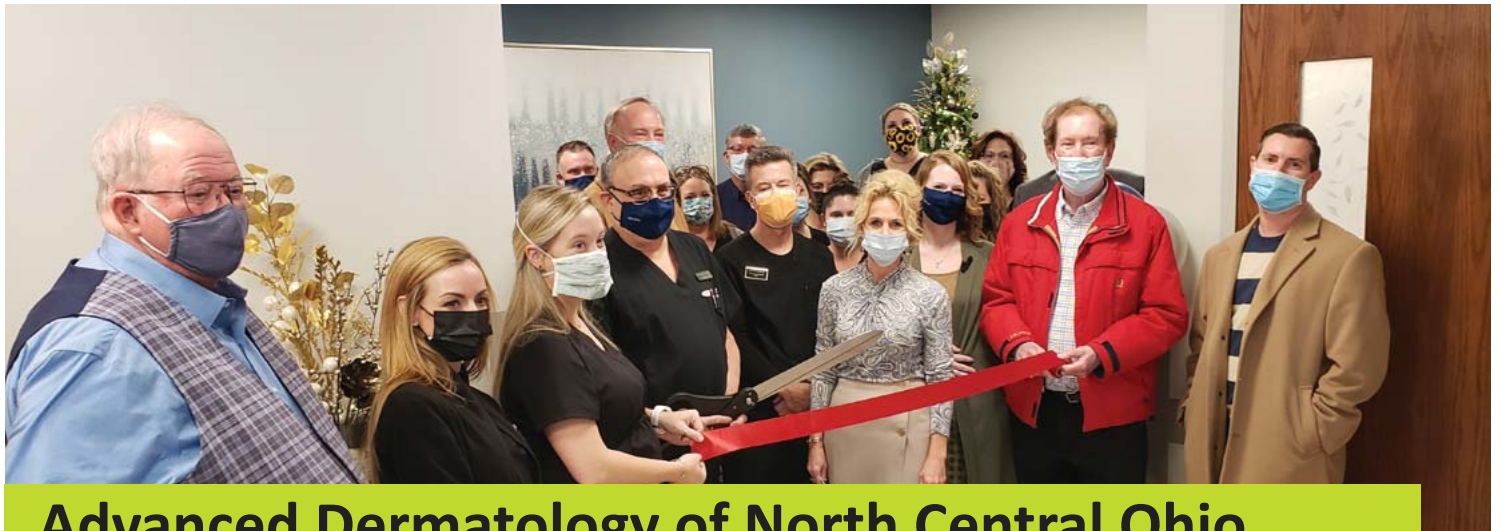
Advanced Dermatology of North Central Ohio