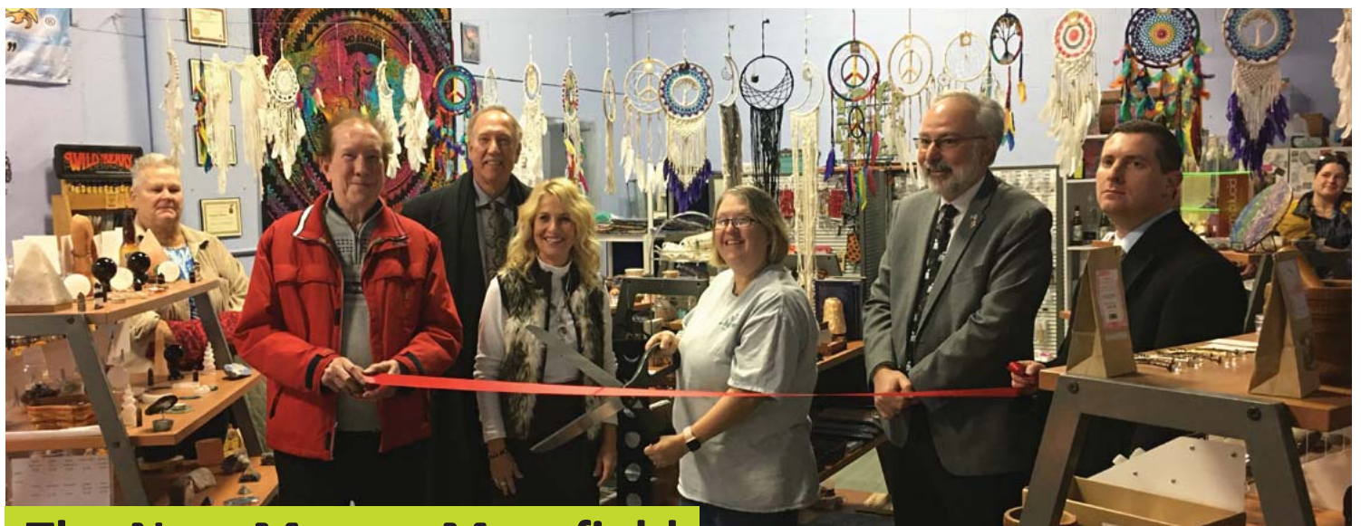
The New Moon - Mansfield