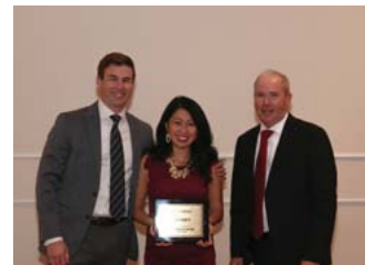
SLUSS REALTY CO.