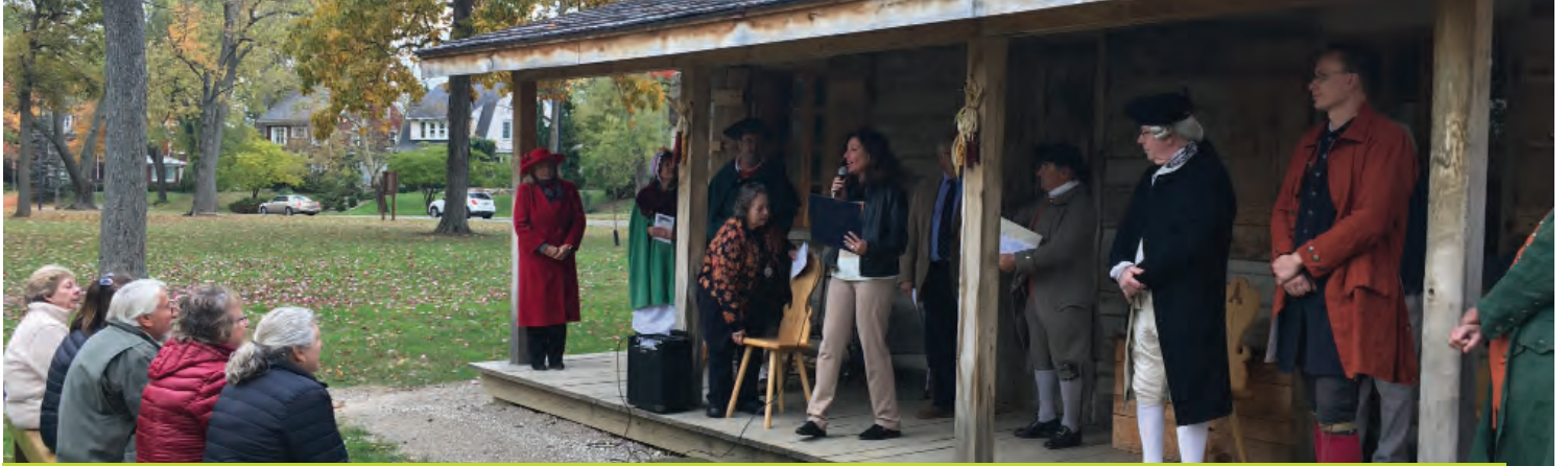
The Petersburg Cabin and Hawk's Nest Forge & Cooperage - Mansfield