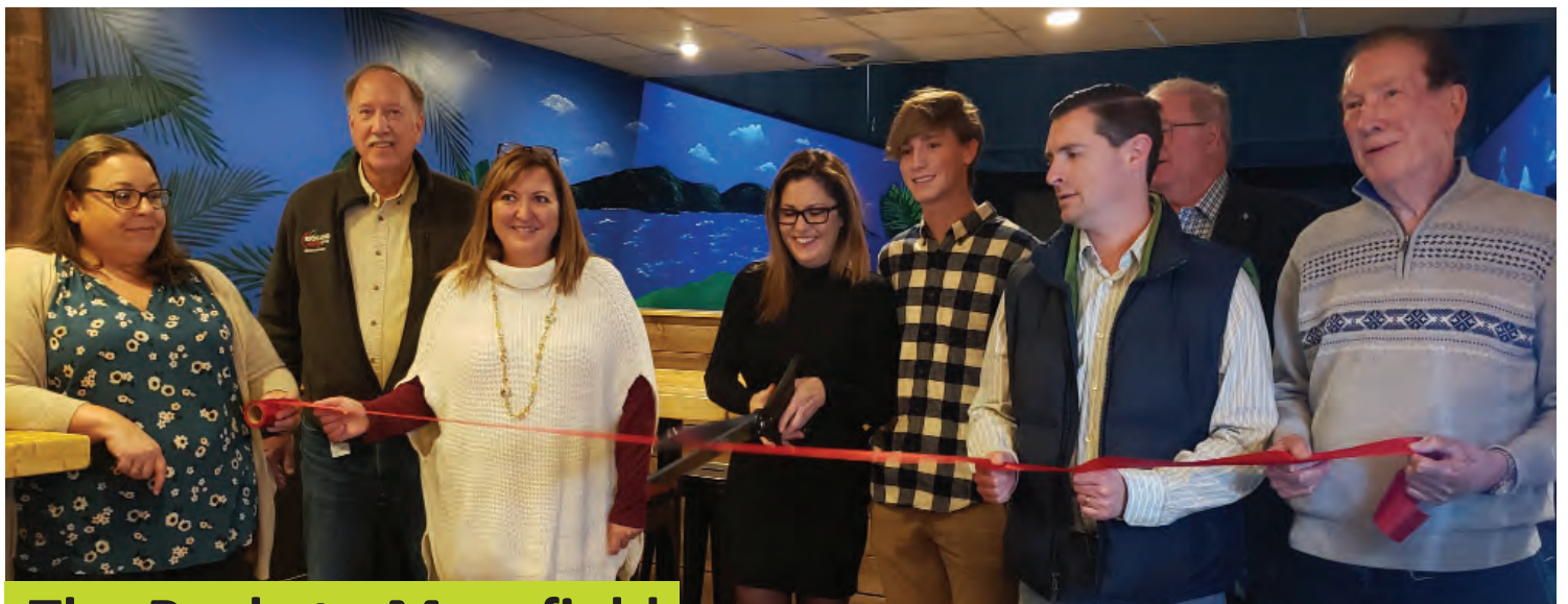
The Bucket - Mansfield