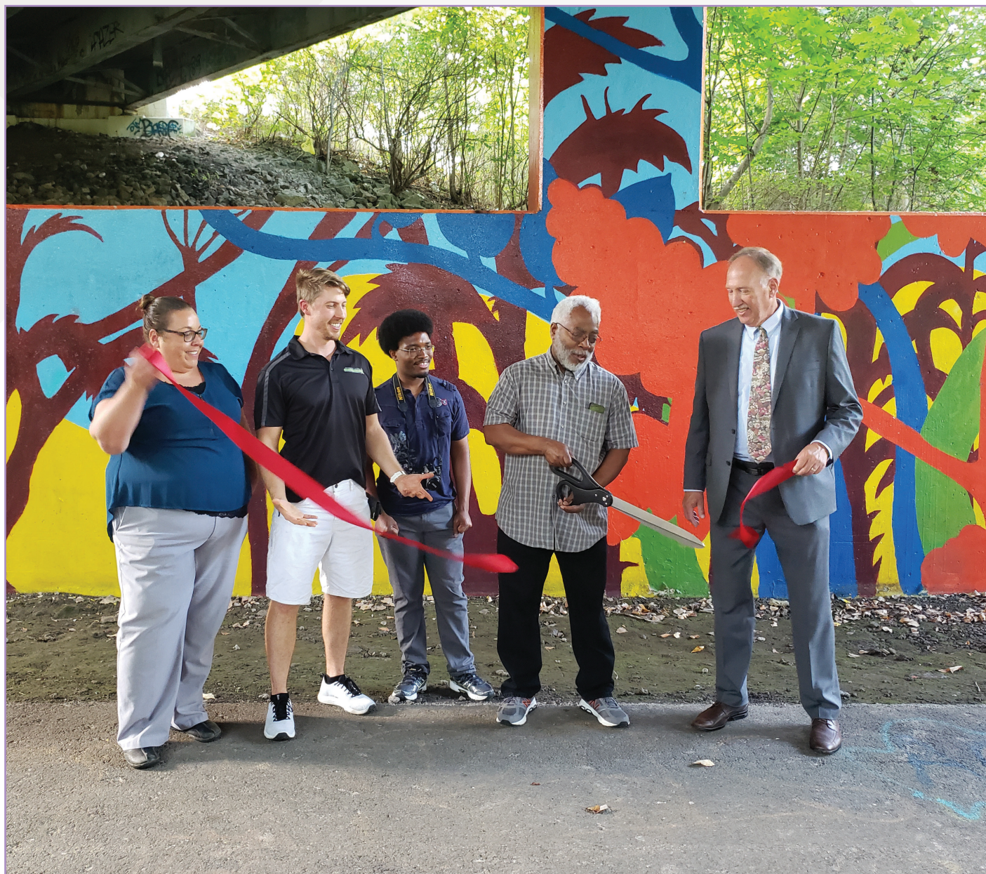
Rededication for the B & O Bike Trail Mural