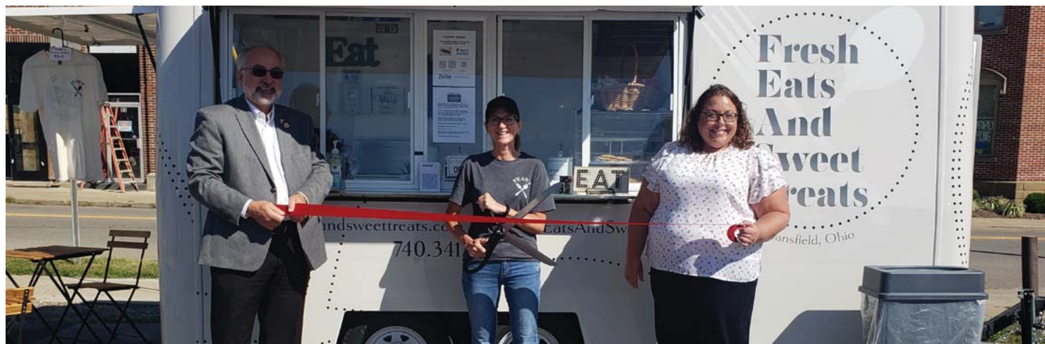
Fresh Eats and Sweet Treats Food Truck Ribbon Cutting