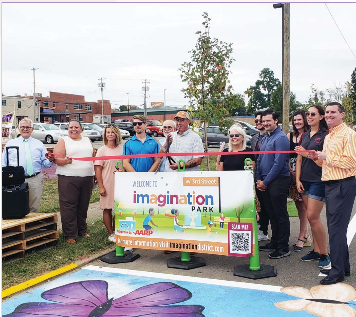
"Imagination Park on W. 3rd St." ribbon cutting