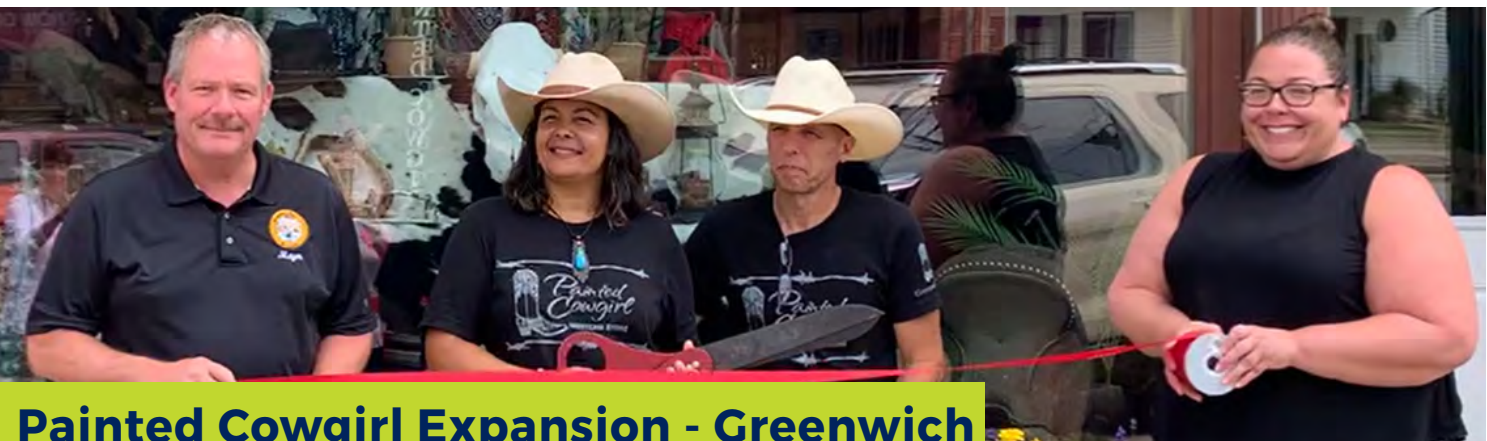
Painted Cowgirl Expansion - Greenwich