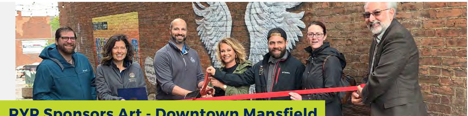
RYP Sponsors Art - Downtown Mansfield