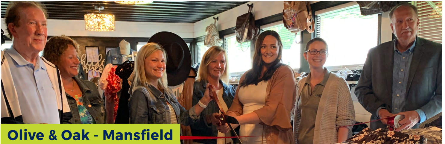
Olive & Oak - Mansfield