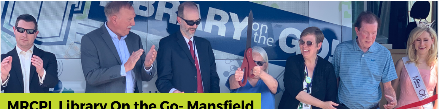
MRCPL Library On the Go- Mansfield