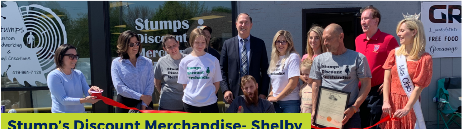
Stump's Discount Merchandise- Shelby