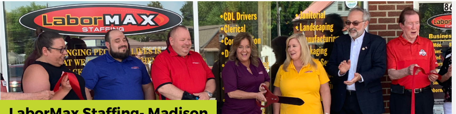
LaborMax Staffing- Madison