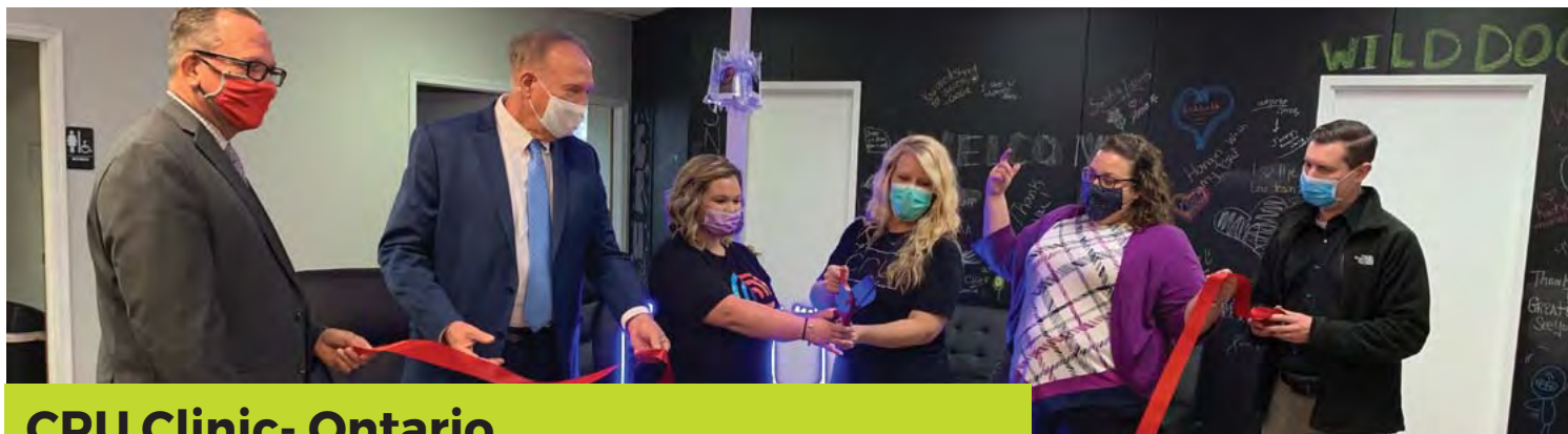
CRU Clinic- Ontario