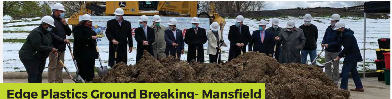
Edge Plastics Ground Breaking- Mansfield