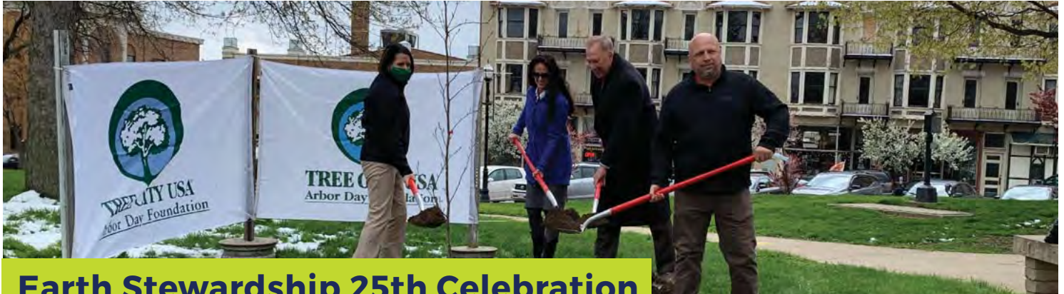
Earth Stewardship 25th Celebration