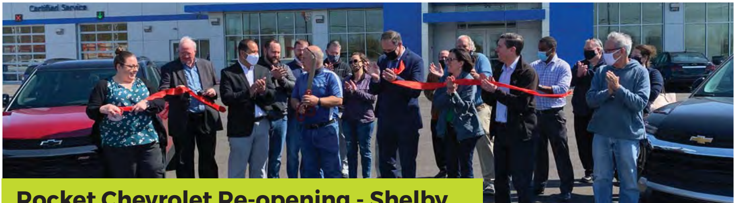
Rocket Chevrolet Re-opening - Shelby