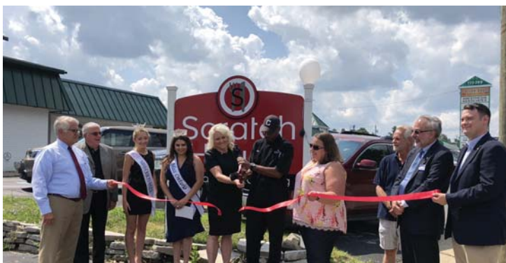
Scratch House Restaurant & Catering - Mansfield

See the Chamber facebook page for even more ribbon cutting photos!