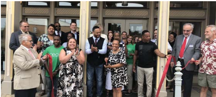
NECIC - Mansfield