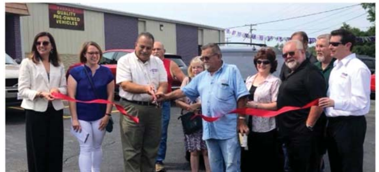
Paone's Quality Pre-Owned Vehicles - Madison Township