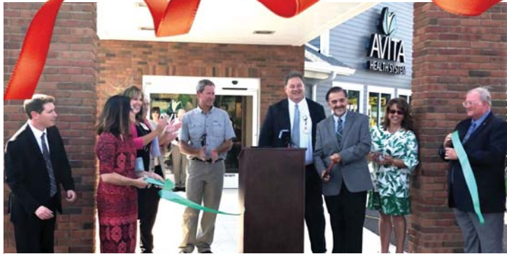
Avita Bellville Medical Center