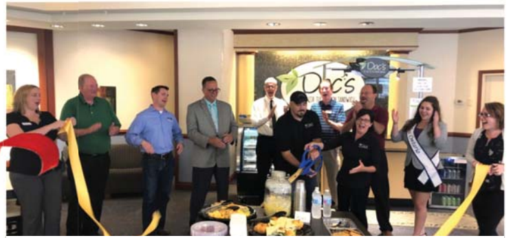
Doc's - Richland Mall