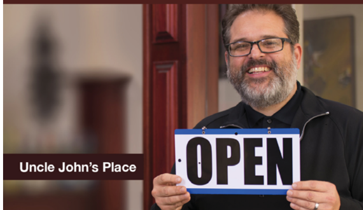
Uncle John's Place