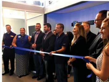
ES Consulting (Ontario)