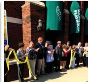
Mansfield Playhouse (Mansfield)