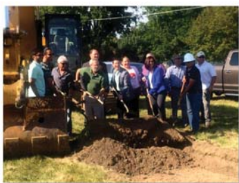
Valero 24 Station (Shelby)