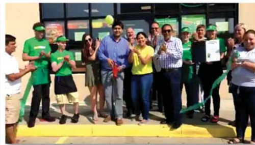
Subway (Springfield Twp)