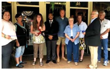
The Chill—Downtown Ice Cream Parlor (Mansfield)