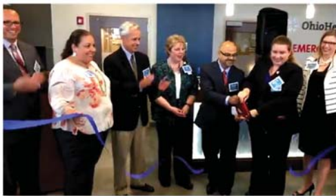
OhioHealth Emergency Room (Ontario)