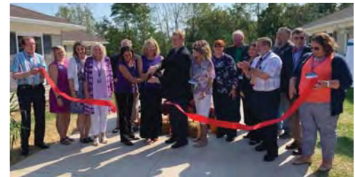
New Beginning Campus (Catalyst Detox Center)