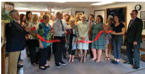
Family Life Counseling 20 yr Anniversary