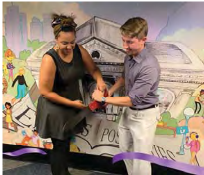
Main Library Mural