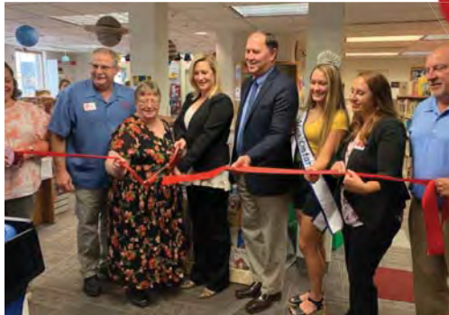
Little Buckeye Traveling Vet Exhibit