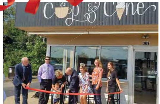
Cup & Cone - Lexington