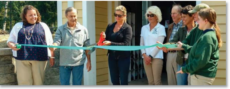
Raemelton Therapeutic Equestrian Center ("Beyond Dreams, Within Reach" campaign)