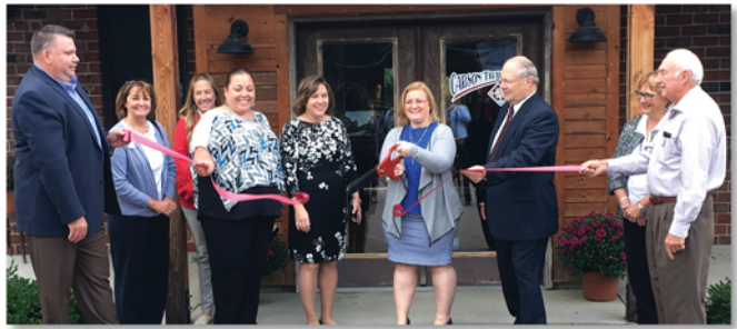
Carson Travel (Lexington)