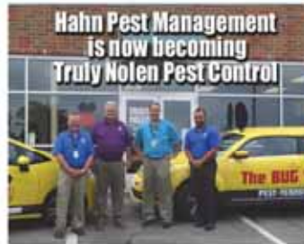
Hahn Pest Management is now becoming Truly Nolen Pest Control