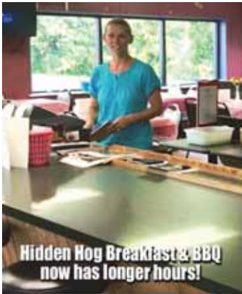
Hidden Hog Breakfast & BBQ now has longer hours!