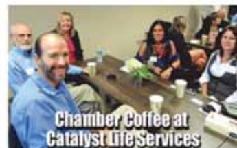
Chamber Coffee at Catalyst Life Services