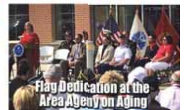
Flag Dedication at the Area Agency on Aging