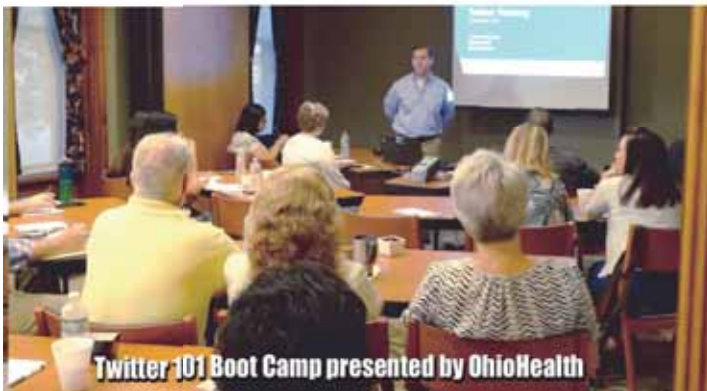
Twitter 101 Boot Camp presented by OhioHealth