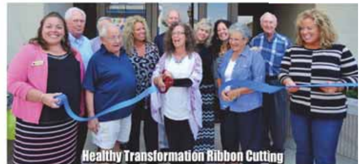
Healthy Transformation Ribbon Cutting