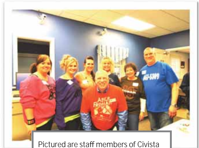
Pictured are staff members of Civista Bank in Shelby, taken during their 80's themed Business After Hours in April.