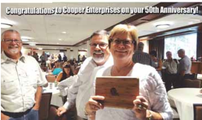
Congratulations to Cooper Enterprises on your 50th Anniversary!