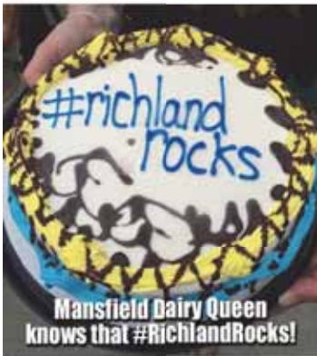
Mansfield Dairy Queen knows that #RichlandRocks!