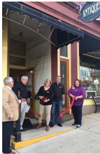
Carrousel Antiques 20th Anniversary (Mansfield)