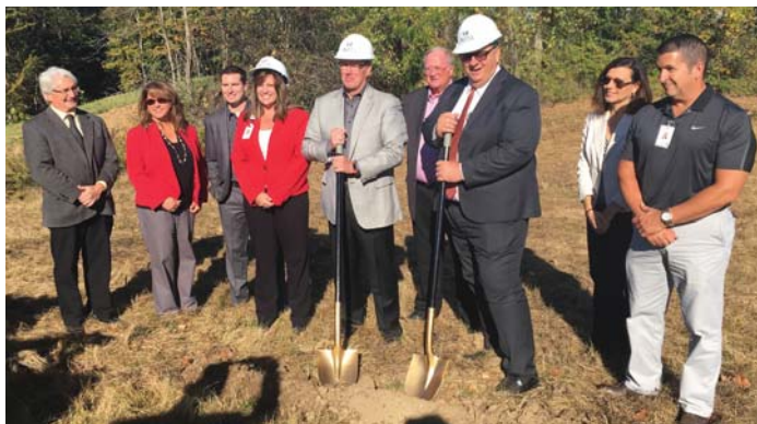
Avita Health System groundbreaking (Bellville)