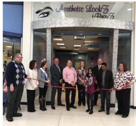
Aesthetic Lookz i-Browz (Richland Mall)