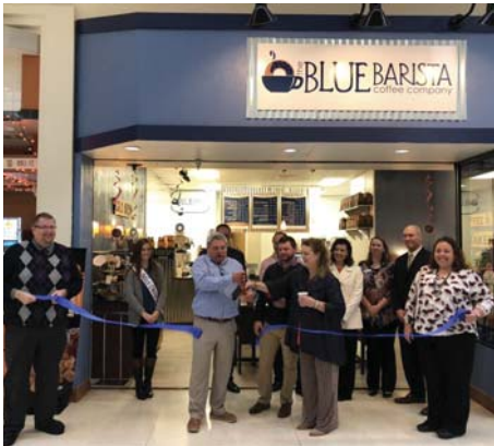
Blue Barista Coffee Co. (Richland Mall)