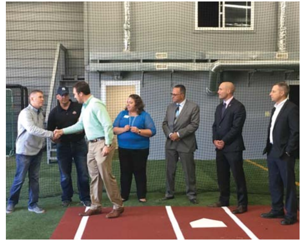
JJS Sports Academy (Mansfield/Ontario)