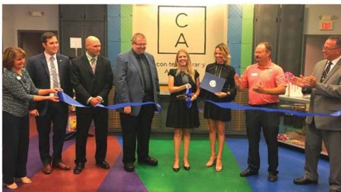
Contemporary Art Space (Richland Mall)