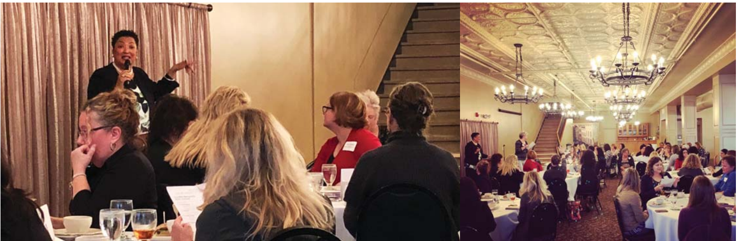
Photos from our October Lunch WISE event

This collaborative series is being co-hosted by the Richland Area Chamber, Mind Body Align and the Small Business Development Center at NCSC.