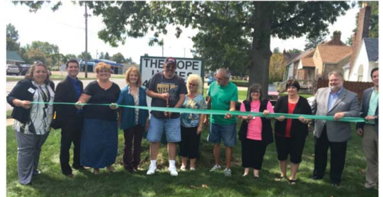
The Hope Homes of Richland County (Mansfield)