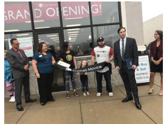
Clothes Mentor (Ontario)