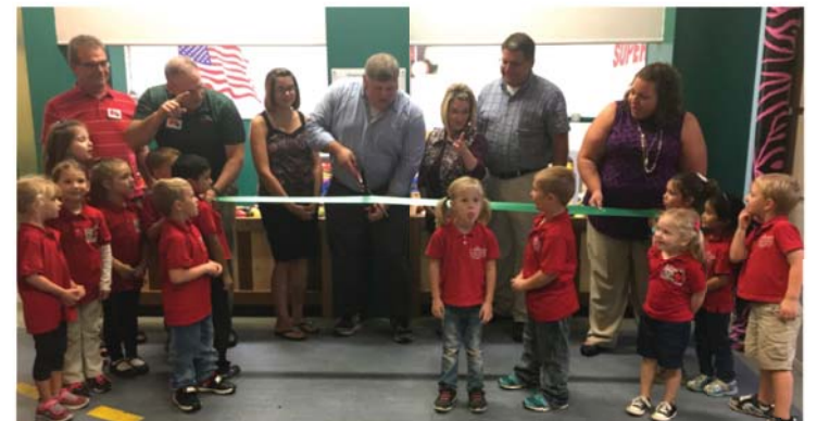
Little Buckeye Children's Museum Grocery Store Exhibit (Mansfield)