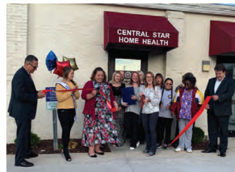
Central Star Home Health - Ontario