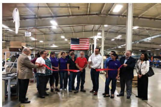
DECA Manufacturing - Lexington