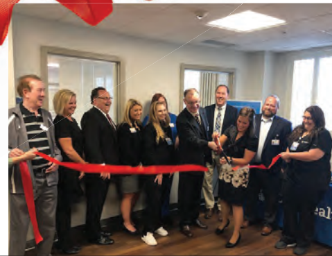
OhioHealth Shelby Primary Care Office - Shelby