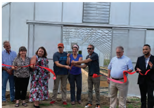
GrowFourth Urban Farm - Mansfield