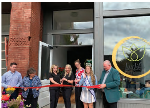
LuxLife MedSpa - Mansfield