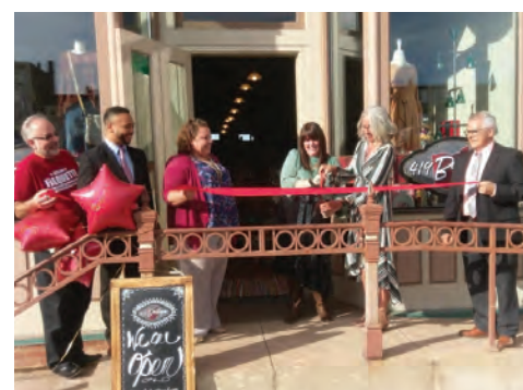
419 Boutique - Mansfield