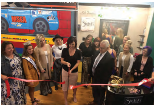
Little Buckeye/ Studio 19 Exhibit - Mansfield