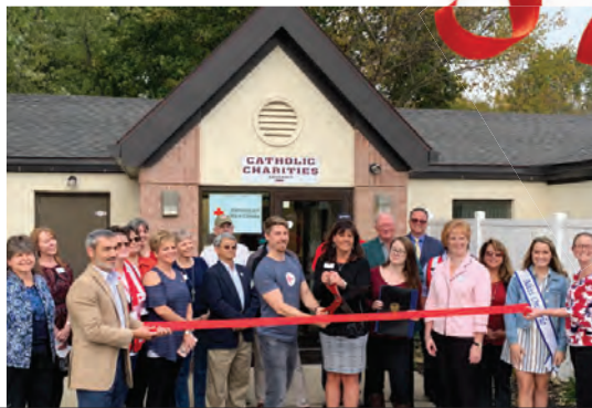
American Red Cross - Mansfield