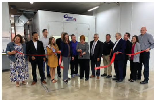
Baker's Collision and Repair new paint booth - Mansfield