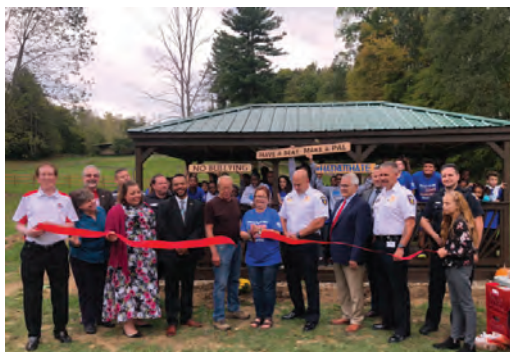
No Bully Gazebo at Happy Hollow - Mansfield