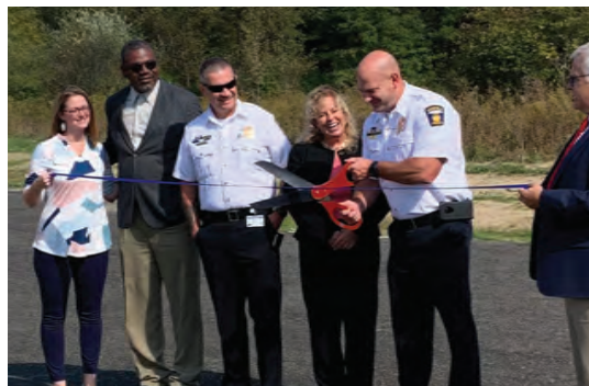
Mansfield PD Shooting Range - Mansfield