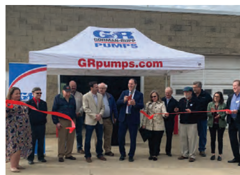
Shelby Wastewater - Shelby