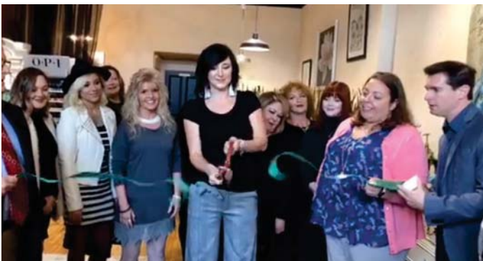
Studio 19 Salon and Spa - Mansfield