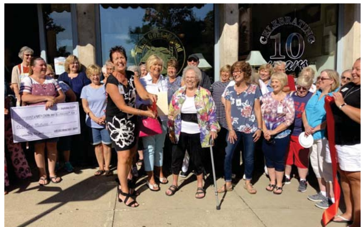
What Goes 'Round Thrift Shoppe - Mansfield