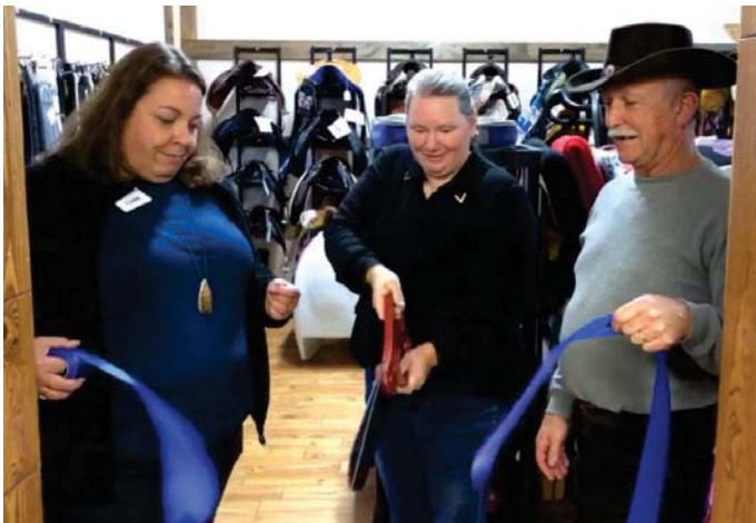
Custom Conchos and Tack LLC - Mansfield