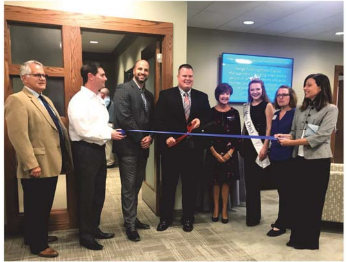
Richland Bank Main Office Remodel- Mansfield