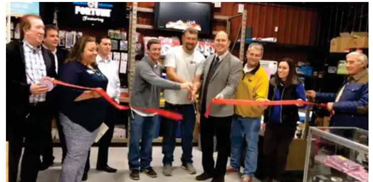
ESL Technologies - Shelby

See the Chamber facebook page for even more ribbon cutting photos!