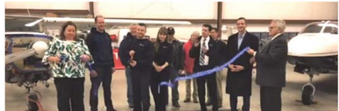
Modern Avionics & Maintenance, Inc. at Mansfield Lahm Airport