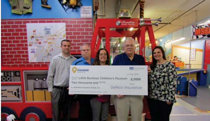
Little Buckeye Children's Museum Firetruck Exhibit sponsored by Hamilton Insurance Group, Inc.