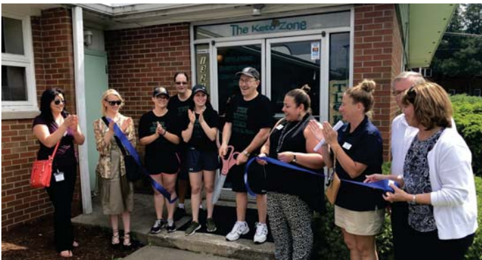
The Keto Zone in Mansfield