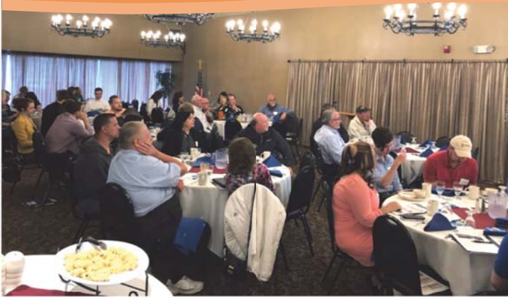
Membership 101 Breakfast at Kobacker Room