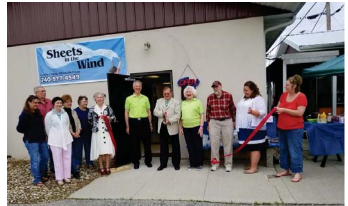
Sheets in the Wind in Plymouth