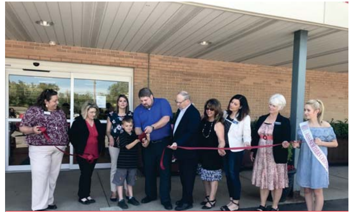
Main Street Market in Lexington