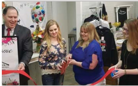
DomBoElli's Baby and Toddler Boutique/ CNS Creations