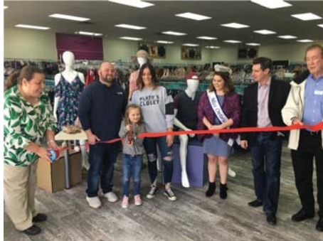
Plato's Closet Remodel