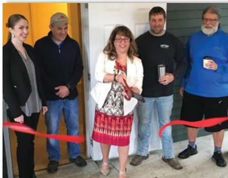
Bellville Bike Depot