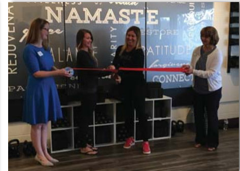
Evolve Studio Lexington