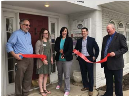
You Can Play That!