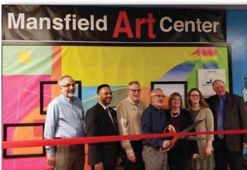
Little Buckeye Mansfield Art Center Exhibit