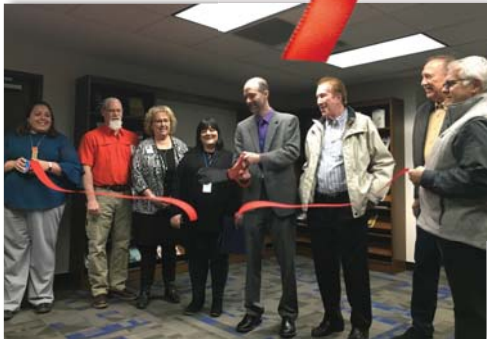
Main Library Remodel