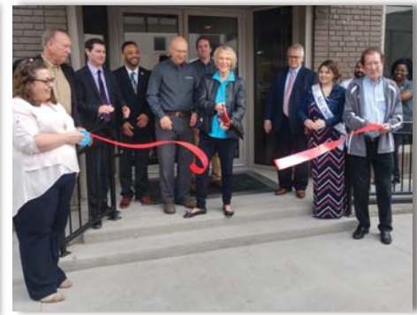
Hudson and Essex Deli/ Cypress Hill Winery