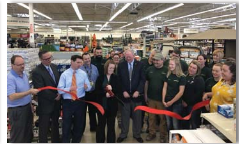
Family Farm and Home