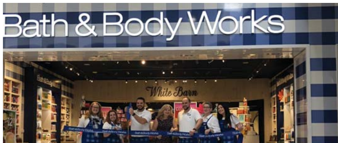
Bath & Body Works new location in the Richland Mall