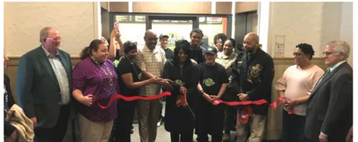
Good Ground Kitchen & Juicery in downtown Mansfield