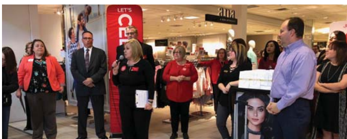
JCPenney 100 Years in Mansfield celebration