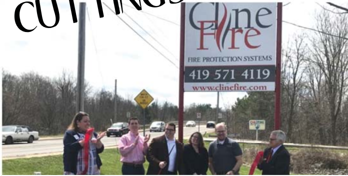
Cline Fire in Mansfield