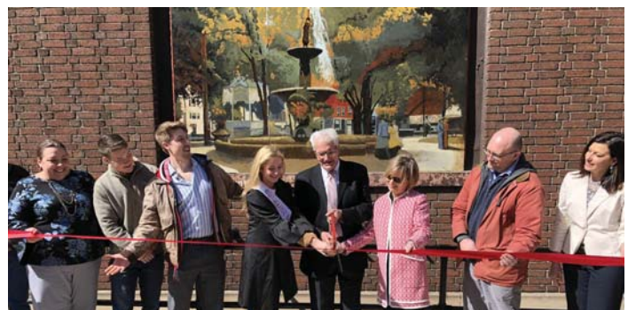
Mankind Murals in downtown Mansfield