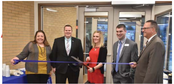
Newly renovated Richland Bank in Ontario