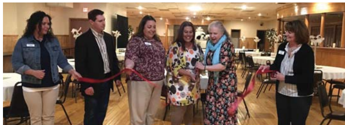
S/C Parties, LLC Event Center in Mansfield