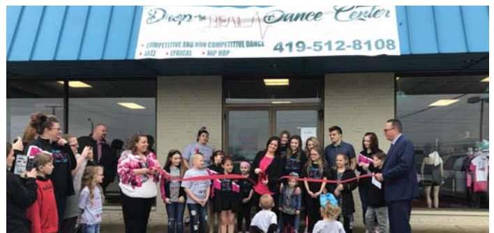
Drop the Beat Dance Center in Ontario