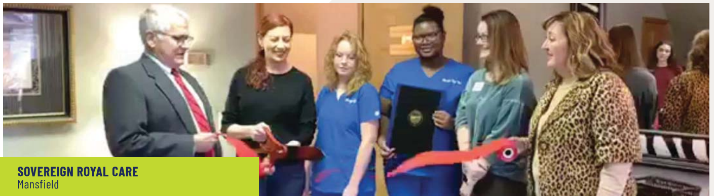
VISIT OUR FACEBOOK PAGE FOR MORE RIBBON CUTTING PICTURES