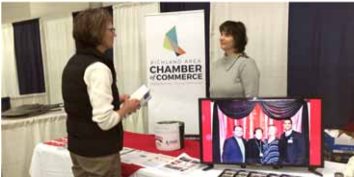
Health, Safety, and Wellness Fair