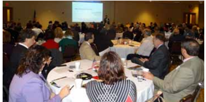
Economic Forecast Breakfast