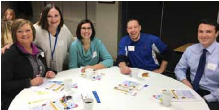
February Chamber Coffee at the Mansfield Richland County Public Library