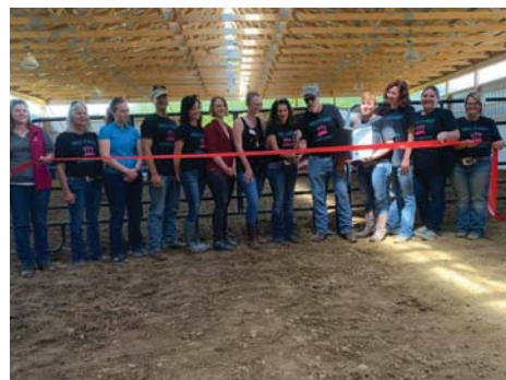
Triple 777 Ranch - Lexington