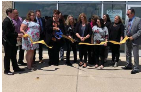
Ross Medical - Ontario Anniversary