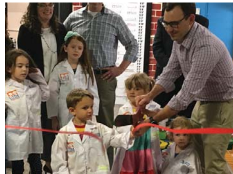
Little Buckeye Childrens Museum Eye Exhibit - Mansfield