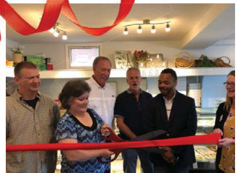
Share N' Dipity - Mansfield