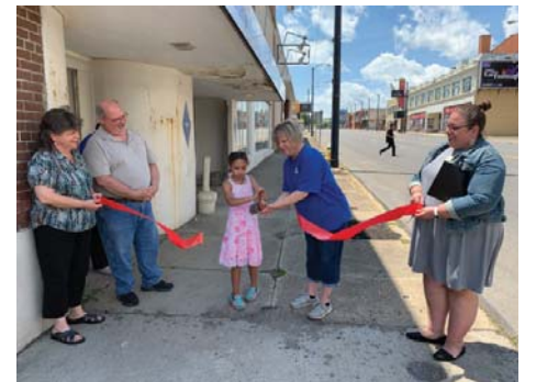
Habitat for Humanity ReStore - Mansfield