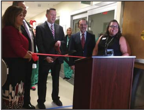
Avita Cath Lab - Ontario