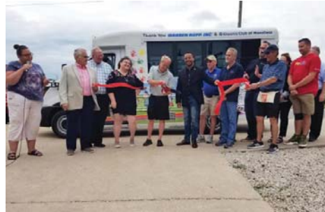
Friendly House Bus - Mansfield Kiwanis of Mansfield