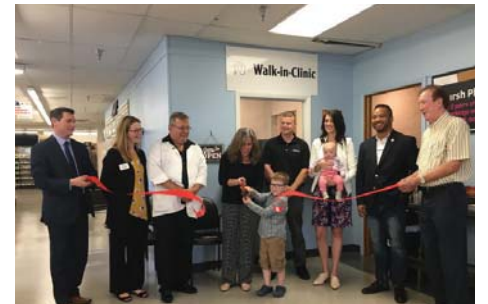
Hursh Drugs Walk-In Clinic, Mansfield