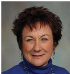
Presented by: Linda Horning-Pitt

The cost is $15 for members/$25 for non-members - please RSVP to reserve your spot (see registration information at bottom of page).