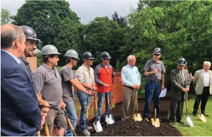
Kingwood Center Gardens Horticultural Services Building