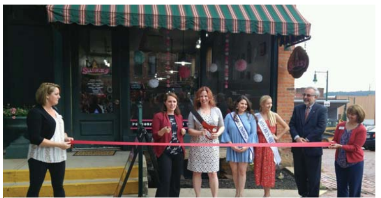
Swavory in Mansfield