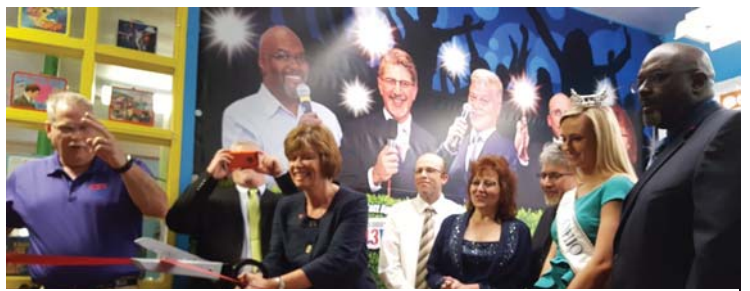
Little Buckeye Children's Museum iHeartMedia Exhibit