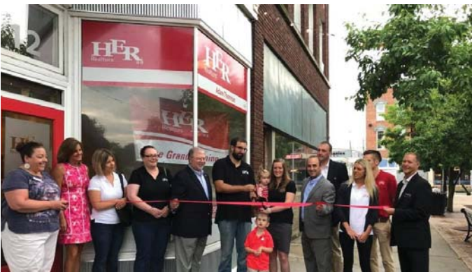
HER Realtors of Mansfield