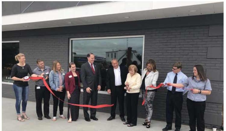
McDonald's in Shelby