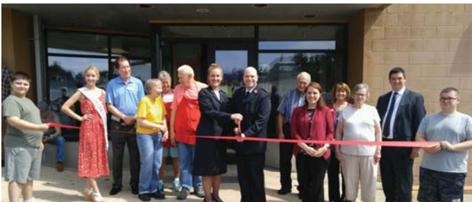
Salvation Army in Mansfield - renovations complete