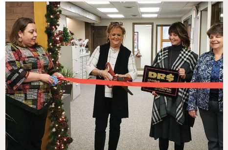
DEBT RECOVERY SOLUTIONS Mansfield