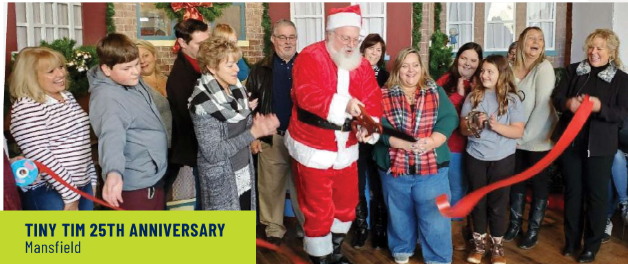
TINY TIM 25TH ANNIVERSARY Mansfield