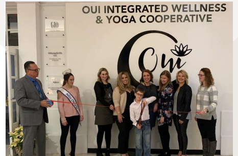
GLO FACIAL BAR Ontario (Richland Mall)