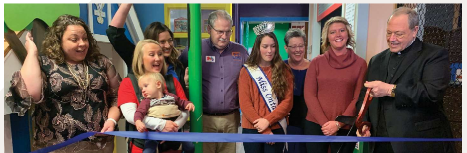
LITTLE BUCKEYE CHILDREN'S MUSEUM - HOUSE EXHIBIT Mansfield