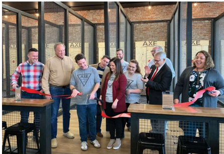
AXE SOCIAL LOUNGE MANSFIELD Mansfield