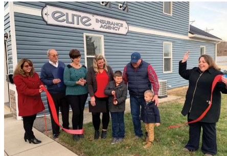
ELITE INSURANCE Bellville