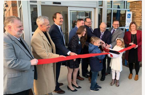
OHIOHEALTH PRIMARY CARE Lexington