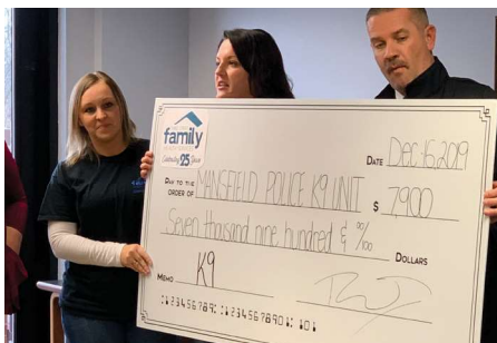
THIRD STREET FAMILY HEALTH Donation to Mansfield PD K-9