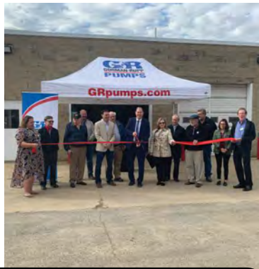
Shelby Waste Water Treatment Plant