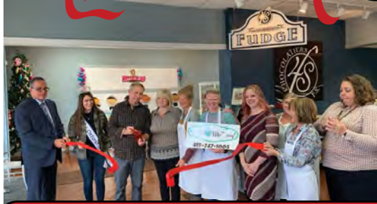
FS Chocolatiers and Bake My Day - Ontario