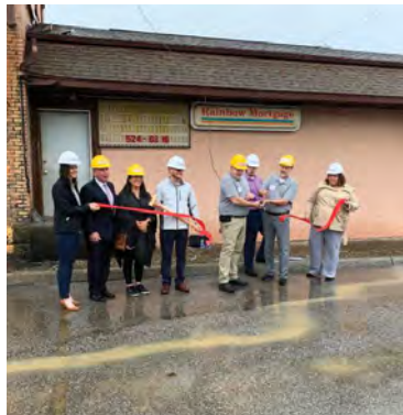
Rainbow Mortgage Demo (For Imagination District)- Mansfield