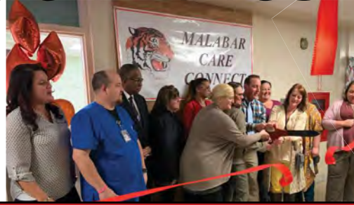
Malabar Care Connect- Mansfield (Malabar Intermediate School Doctor's Office)