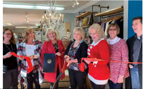
Poppy Boutique- Mansfield