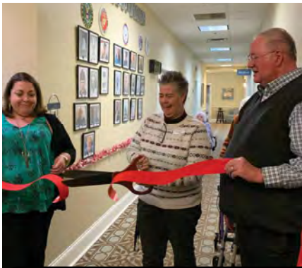
Waterford Wall of Honor (Veteran's Wall)- Mansfield