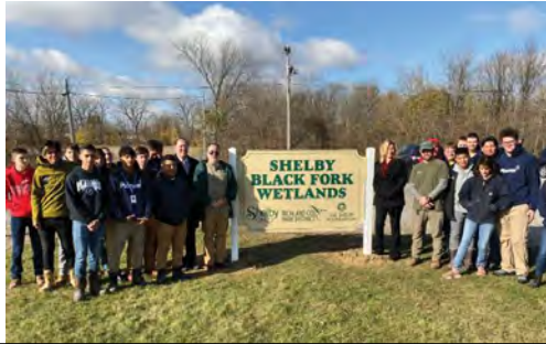
Shelby Blackfork Wetlands Expansion