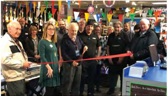
Metronome 57 th Anniversary- Mansfield