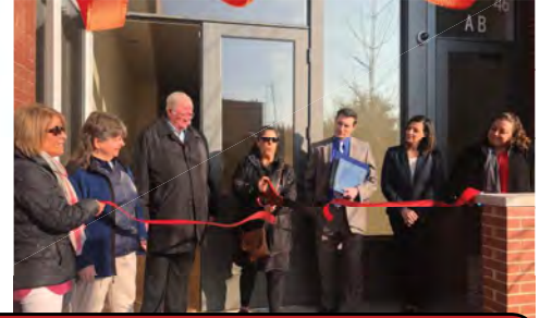
Apartment 46/48- Mansfield