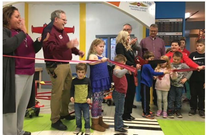
Little Buckeye Children's Museum Airport Exhibit