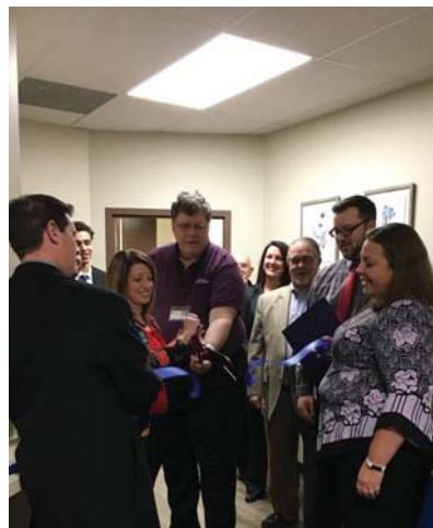
Third Street Family Health Services - Mansfield