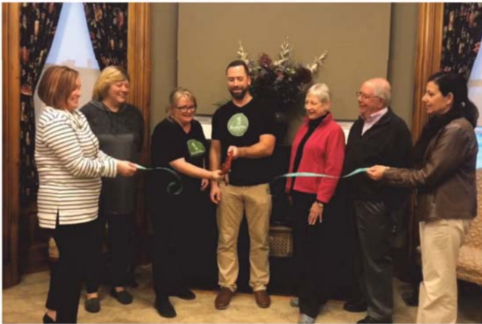
Grub2You - restaurant food delivery to your door