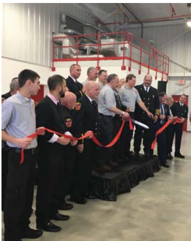
Shelby Fire Department