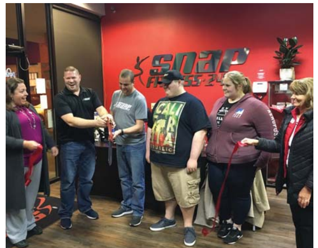
Snap Fitness - Mansfield

See the Chamber facebook page for even more ribbon cutting photos!