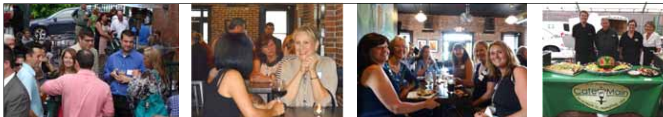
The Phoenix Brewing Company had a fantastic turnout for the July Business After Hours!

Watch for upcoming e-mails announcing more new events!