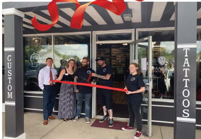
Marksman Tattoo Company - Mansfield