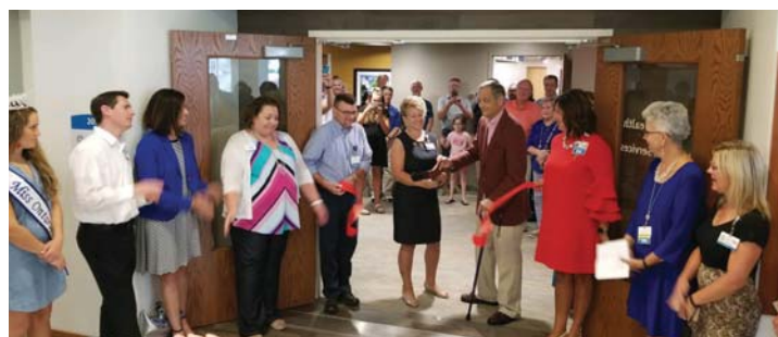
OhioHealth Infusion Center - Mansfield