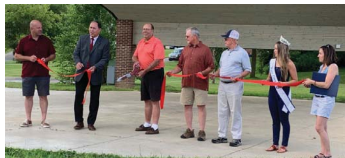
Black Fork Amphitheater - Shelby