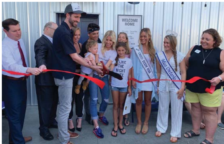
Nickel & Bean - Lexington