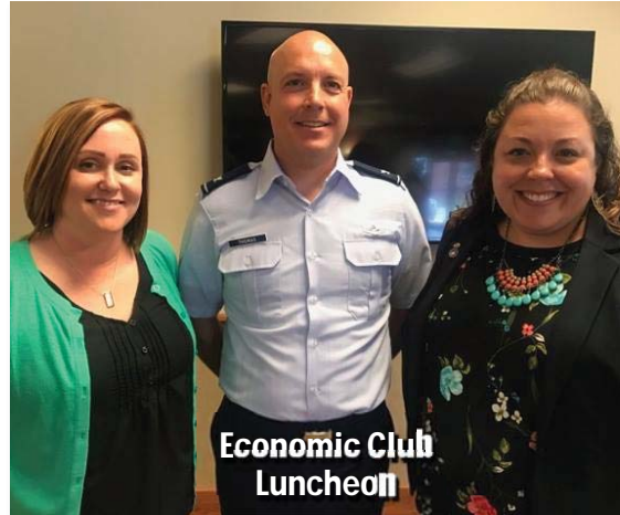
Economic Club Luncheon