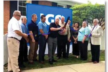
IGS Energy (Mansfield)