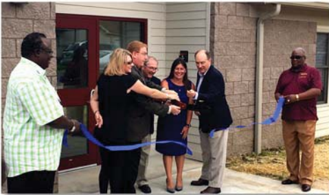
Richland County Mental Health & Recovery Services Board (Mansfield)