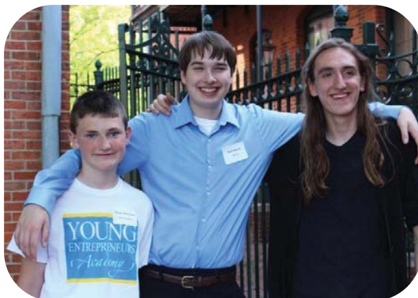
2017 YEA! Graduates