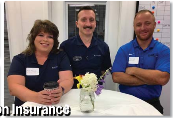
Chamber Coffee at Hamilton Insurance