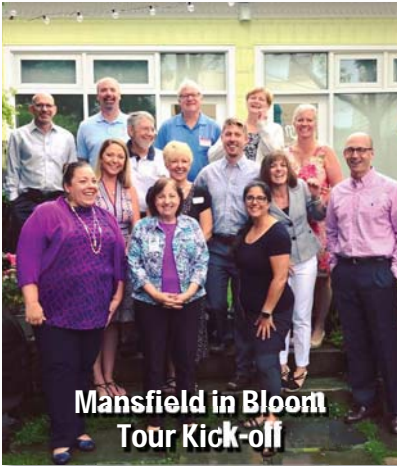
Mansfield in Bloom Tour Kick-off