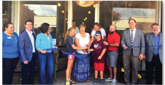
The Fancy Chicken (Shelby)