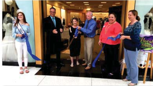
Bridal & Formal Wear by B (Richland Mall)