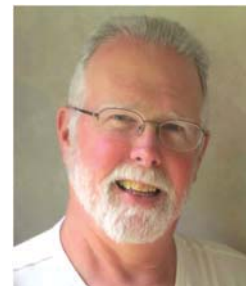
Stan Butts, Guest Columnist Valleyview Country Getaway Vacation Rental Home