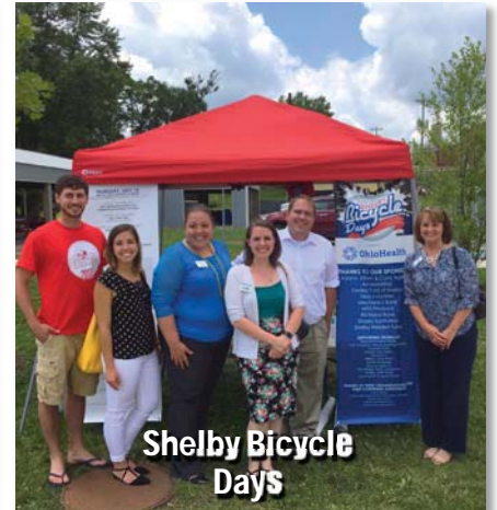
Shelby Bicycle Days