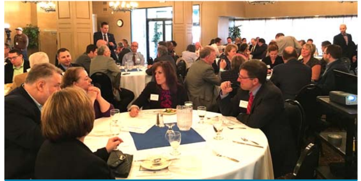
Legislative Luncheon with Congressman Tiberi