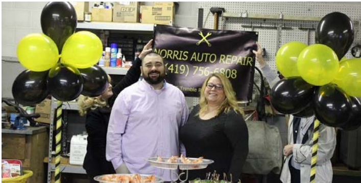
Ribbon cutting at Norris Auto Repair