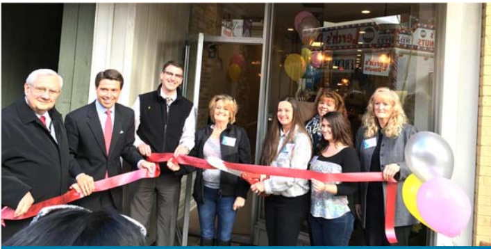
Ribbon cutting at Ashland Cleaning LLC