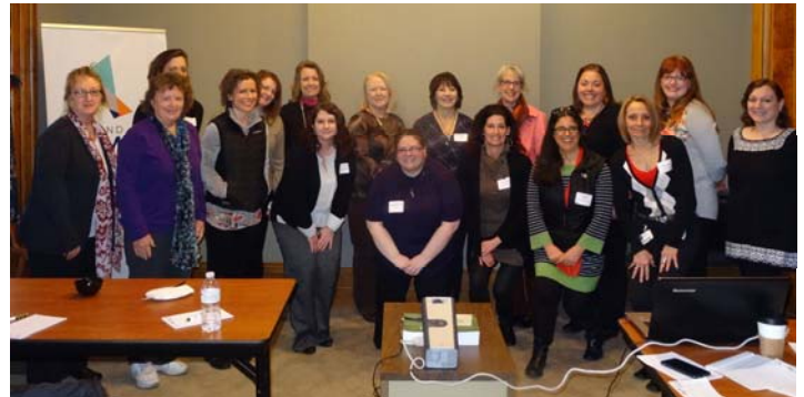
March Business Boot Camp