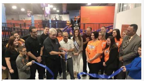
Altitude Trampoline Park - Ontario

Thank you to the 80+ businesses that participated in our Small Business Saturday event!